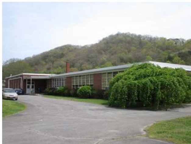
Main Structure Photo