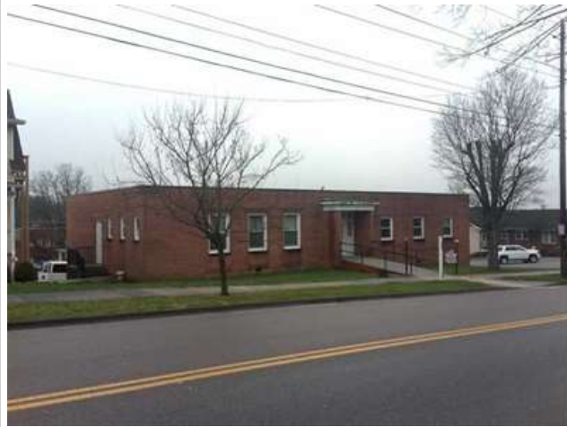
Main Structure Photo