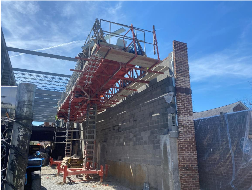
Brick and block XA line on Plumb Alley side