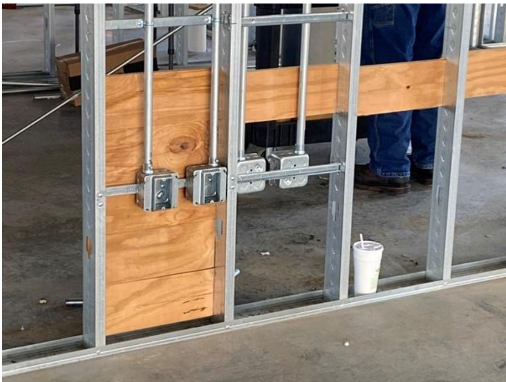
In-wall blocking and electrical boxes/conduit installed