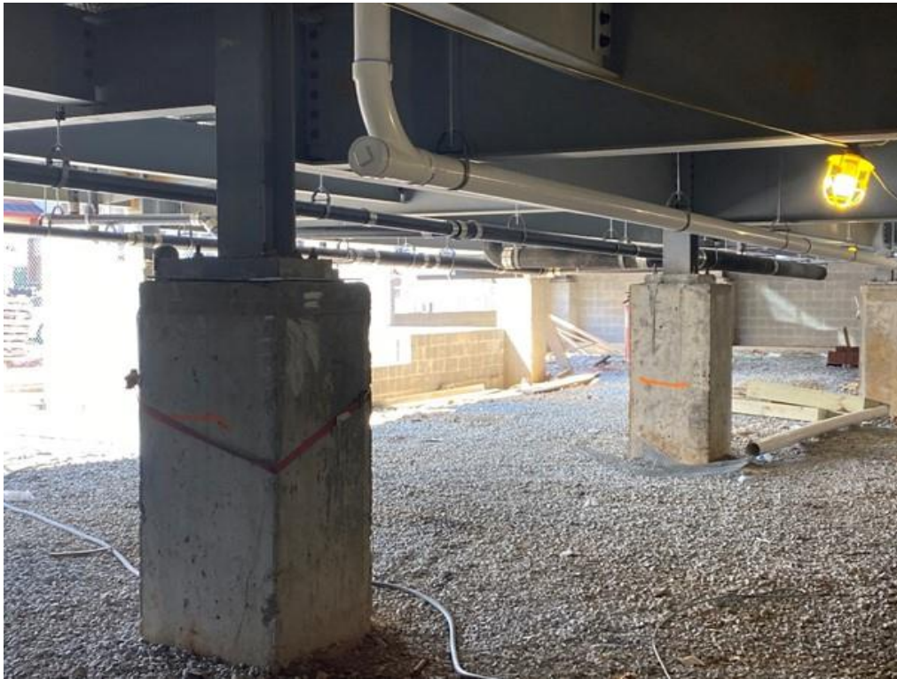
Waste and drain lines in crawl space