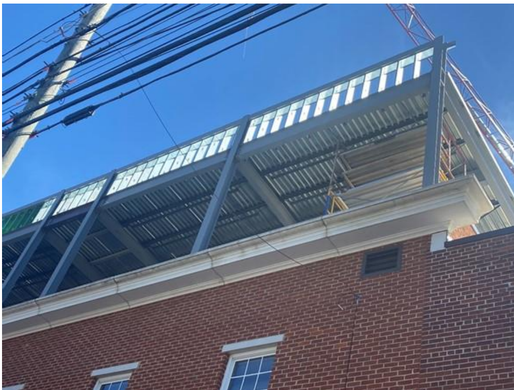
Framing parapet walls Plumb Alley side