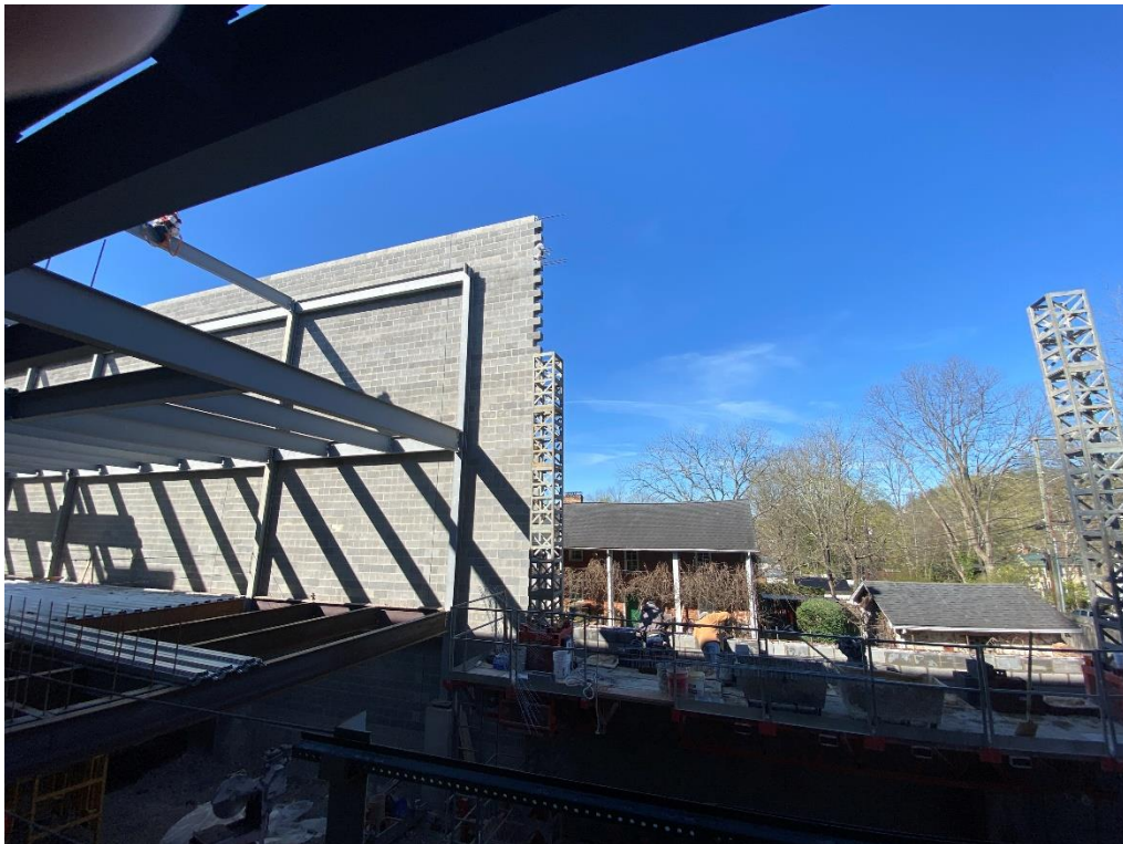
Brick and block XA line, continued