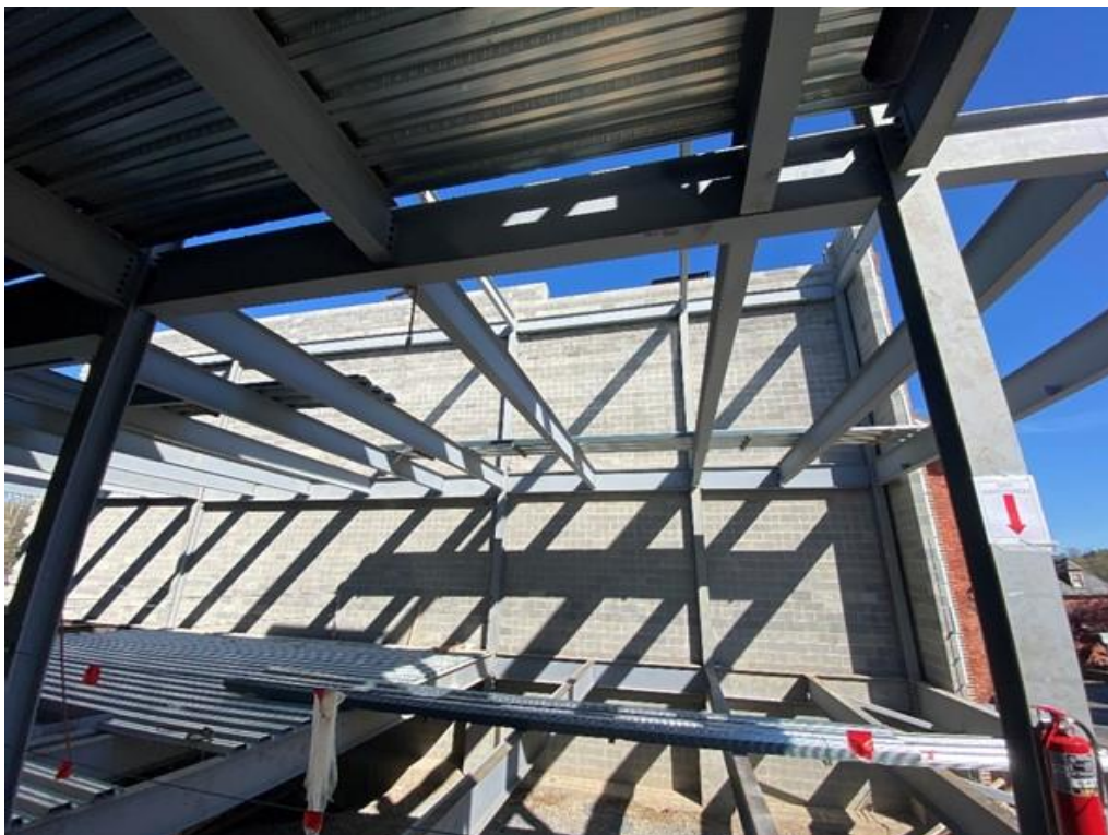
Decking install for sequences 3 & 4