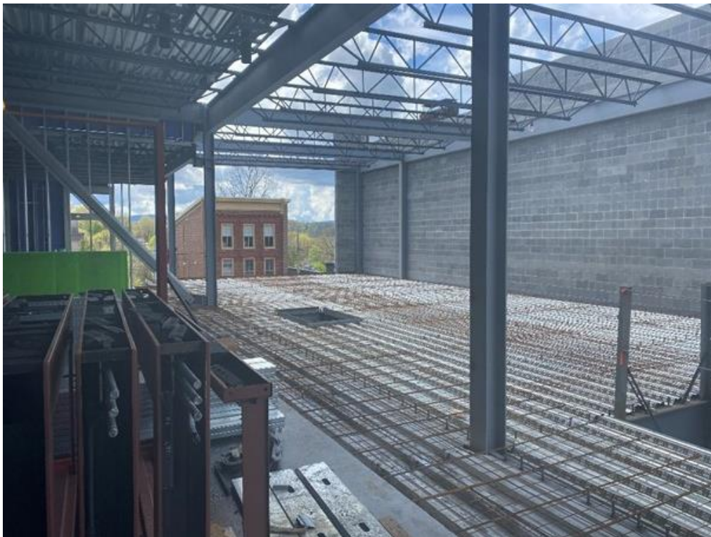
Wire and rebar set for sequence 3,4,5 concrete pour