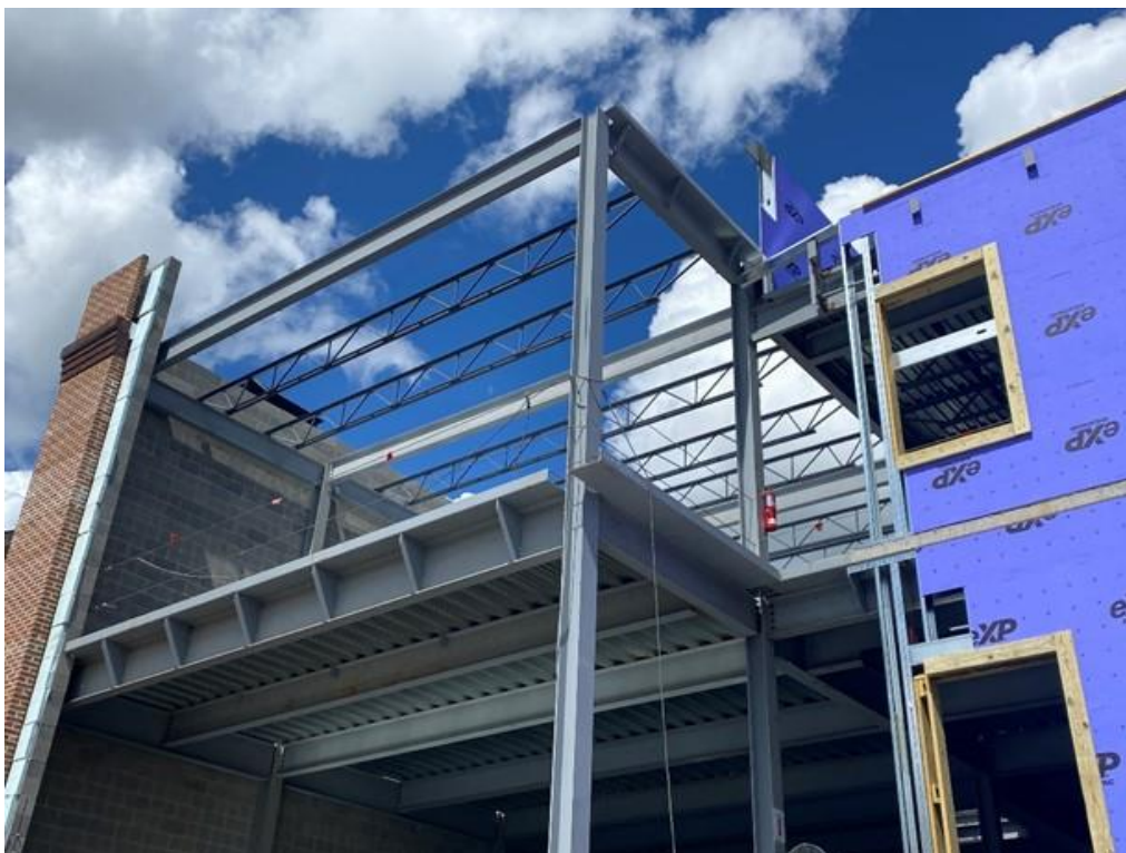
Bar joists set for roof