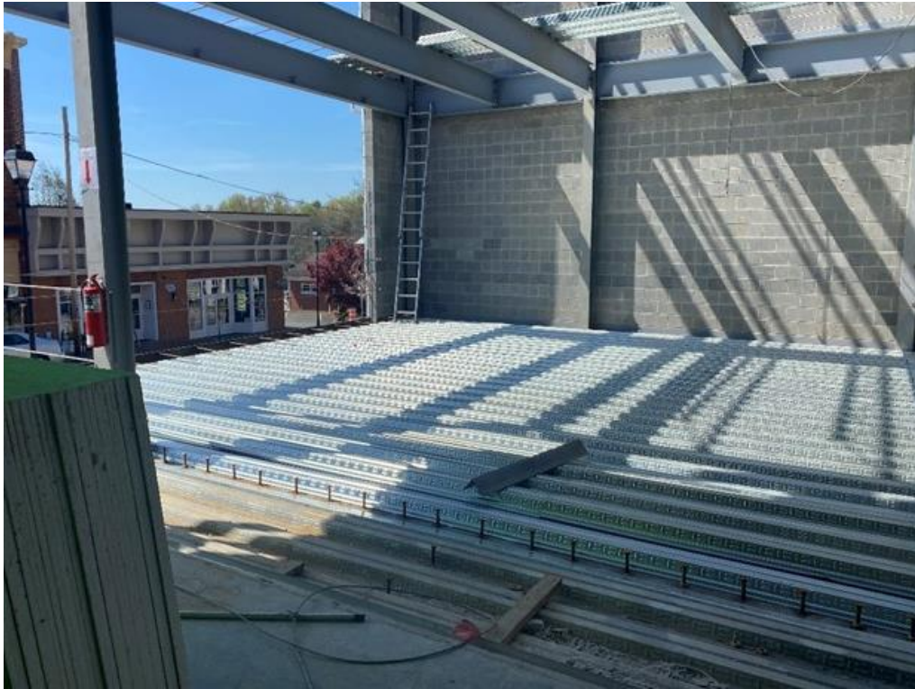
Decking installed for sequence 3