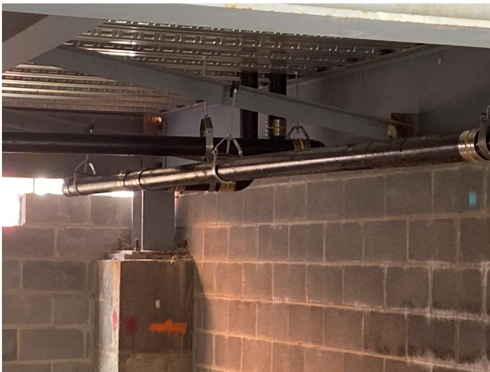
Cast drain being installed in crawl space area