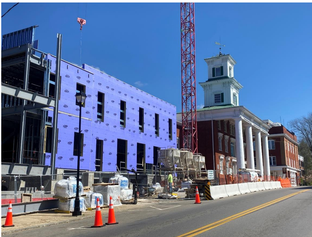
Existing and new addition from Main Street, continued