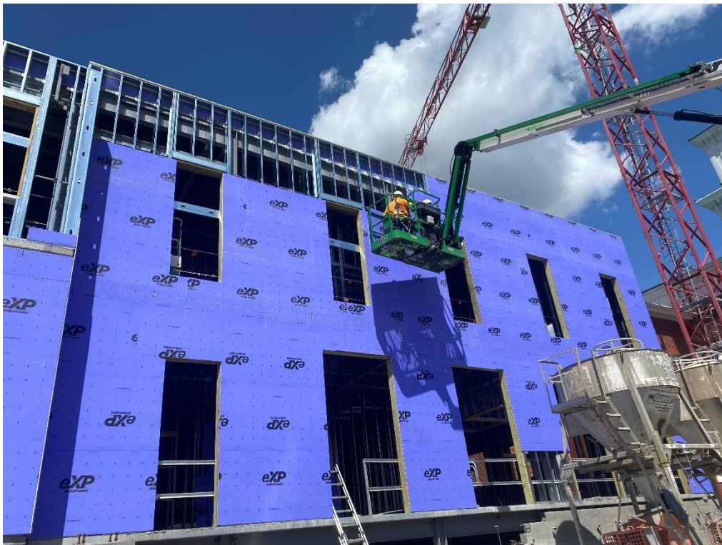
Exterior sheathing, continued