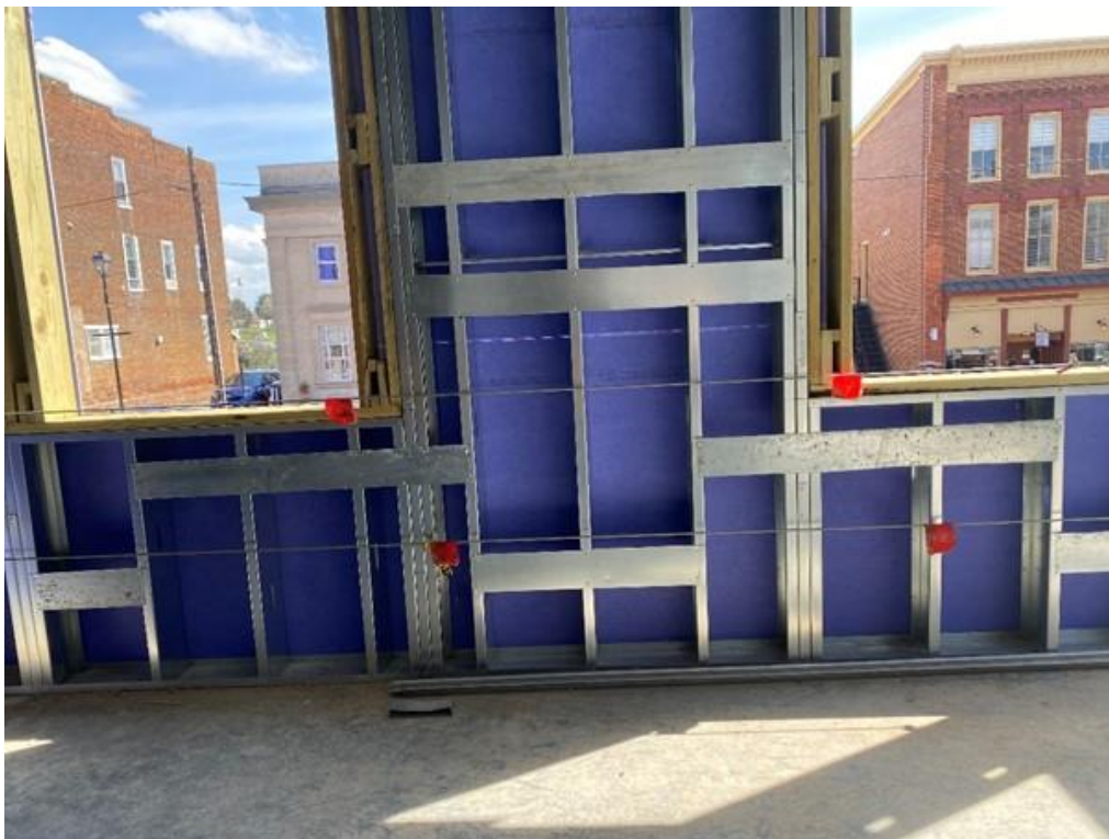
Metal grounds and window blocking