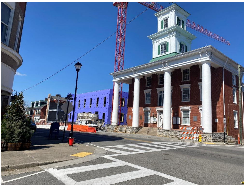
Existing and new addition from Main Street