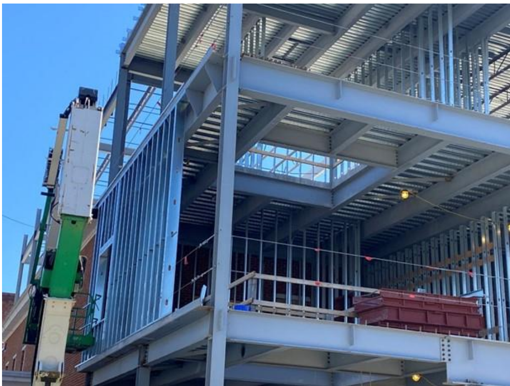
Exterior stud framing on Plumb Alley side, continued