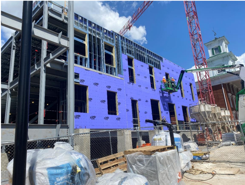
Exterior sheathing Main Street side