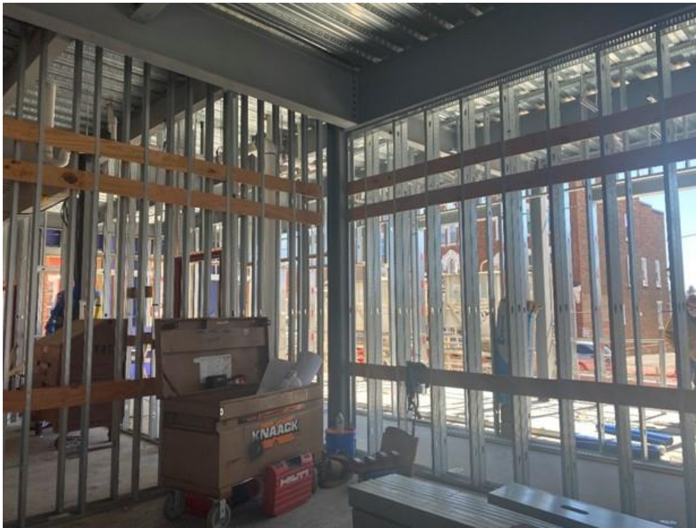
Interior wall framing and wood blocking