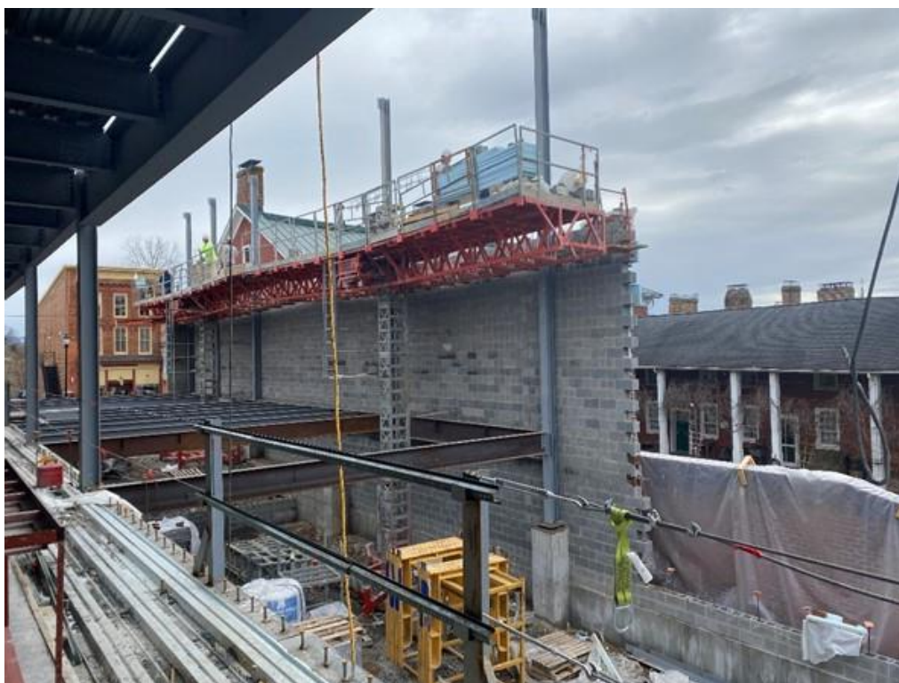
Block and brick installation XA line, continued