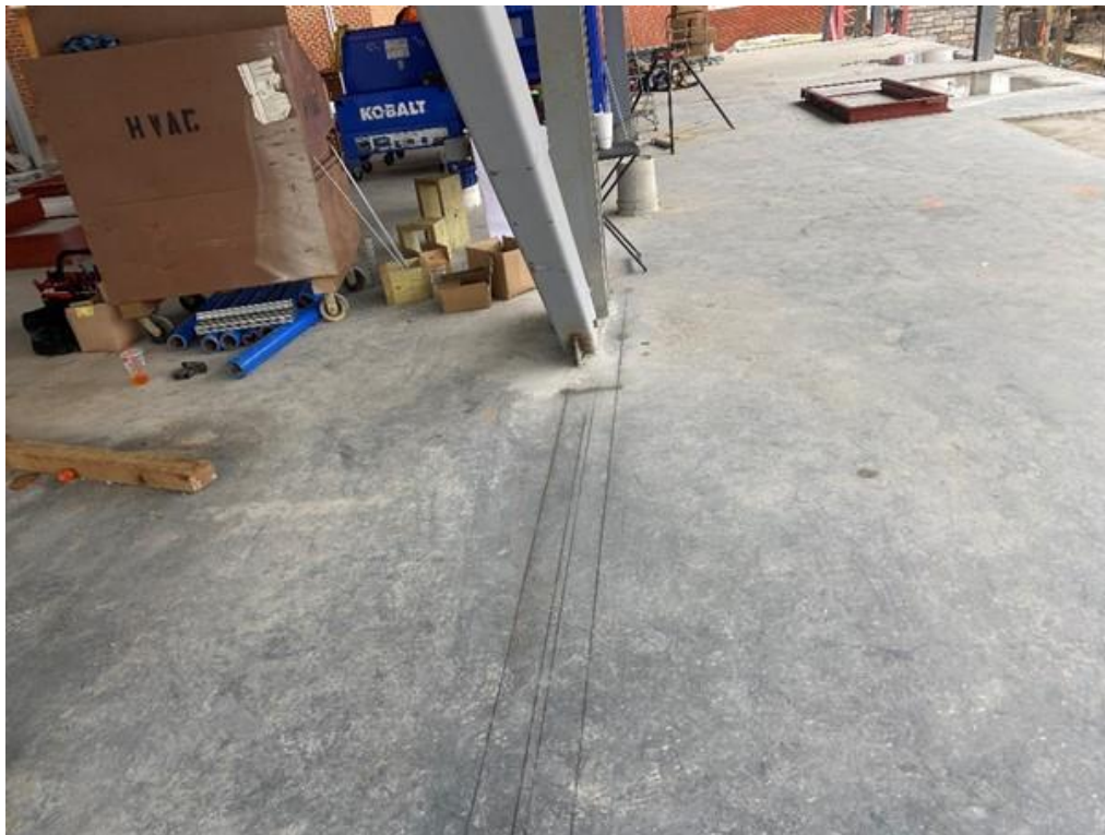
Laying out metal stud walls