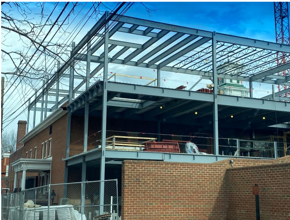
Bar joists and beams installed, Plumb Alley