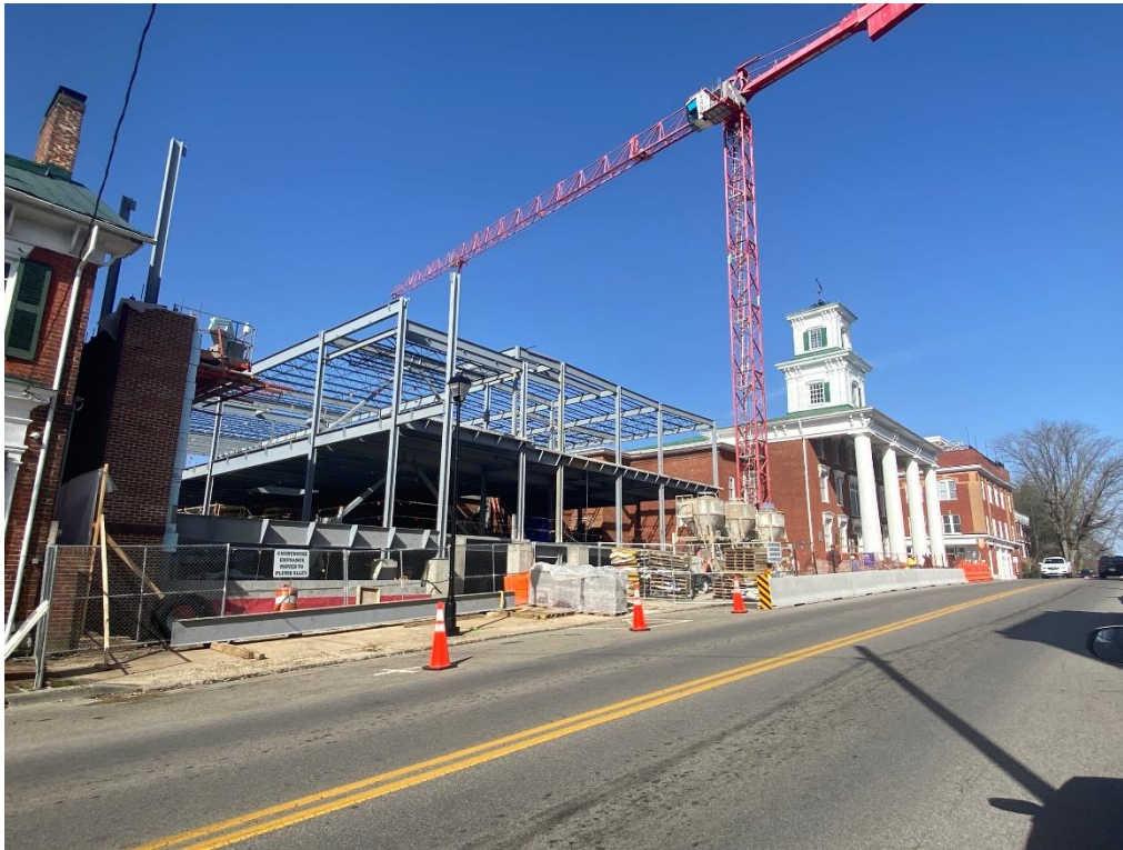
Steel erection ongoing