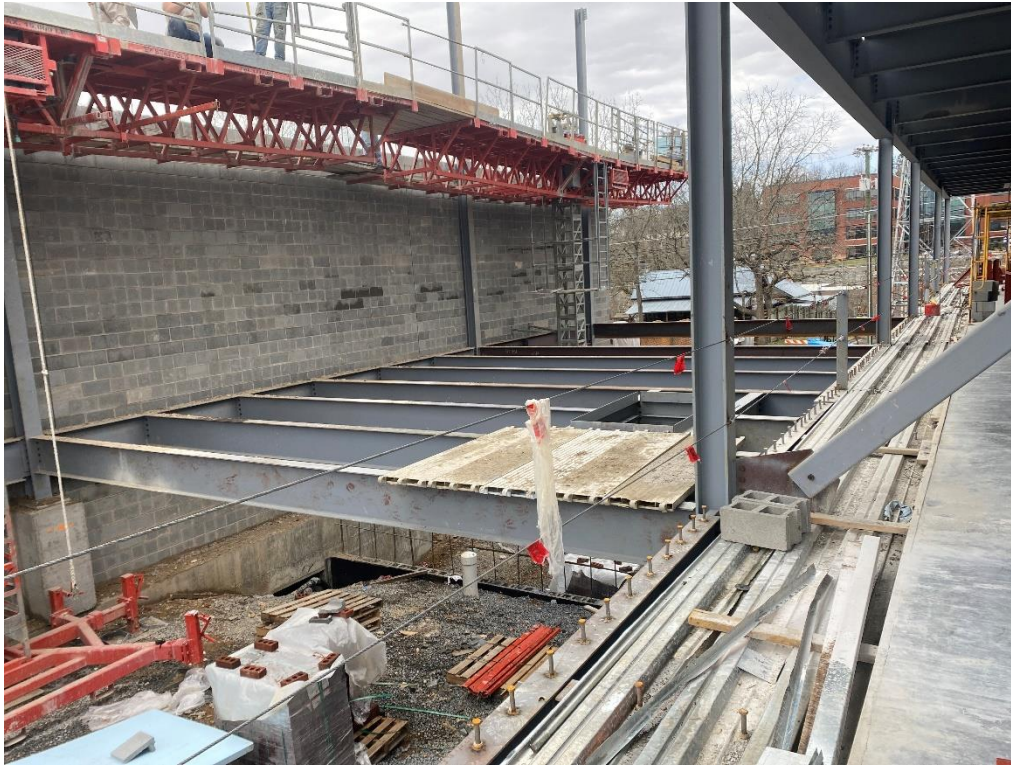
Beams set connecting to XA line wall