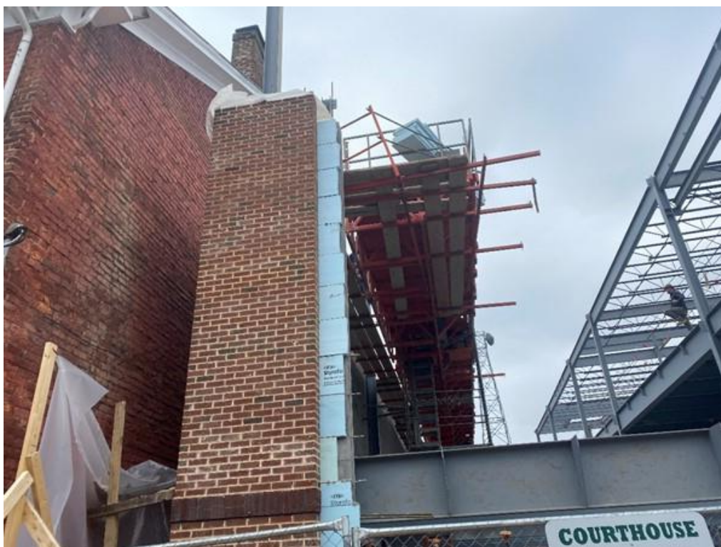
Block and brick installation XA line