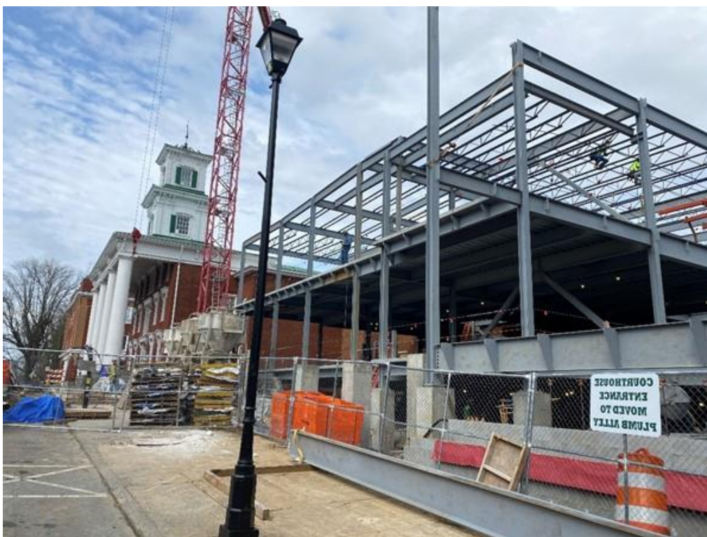
Bar joist bridging, continued