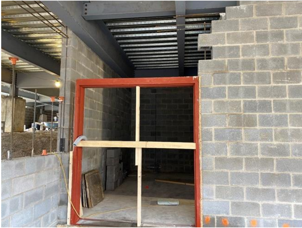
Setting door frame at elevator equipment room