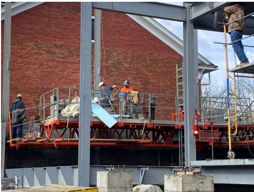
Installing brick and block on XA line