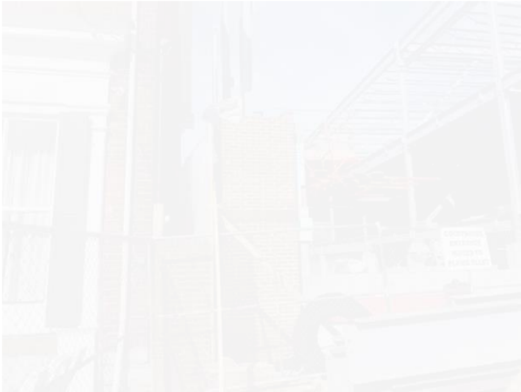
Brick and block installation on XA line