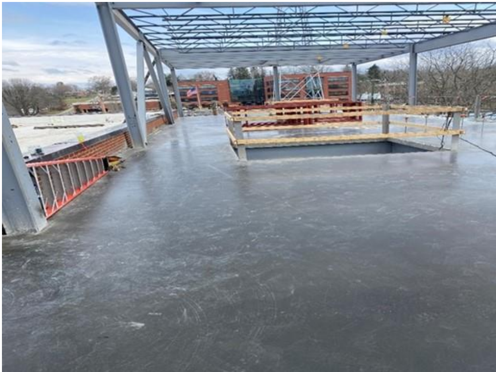
Concrete slab-on-deck poured fourth floor