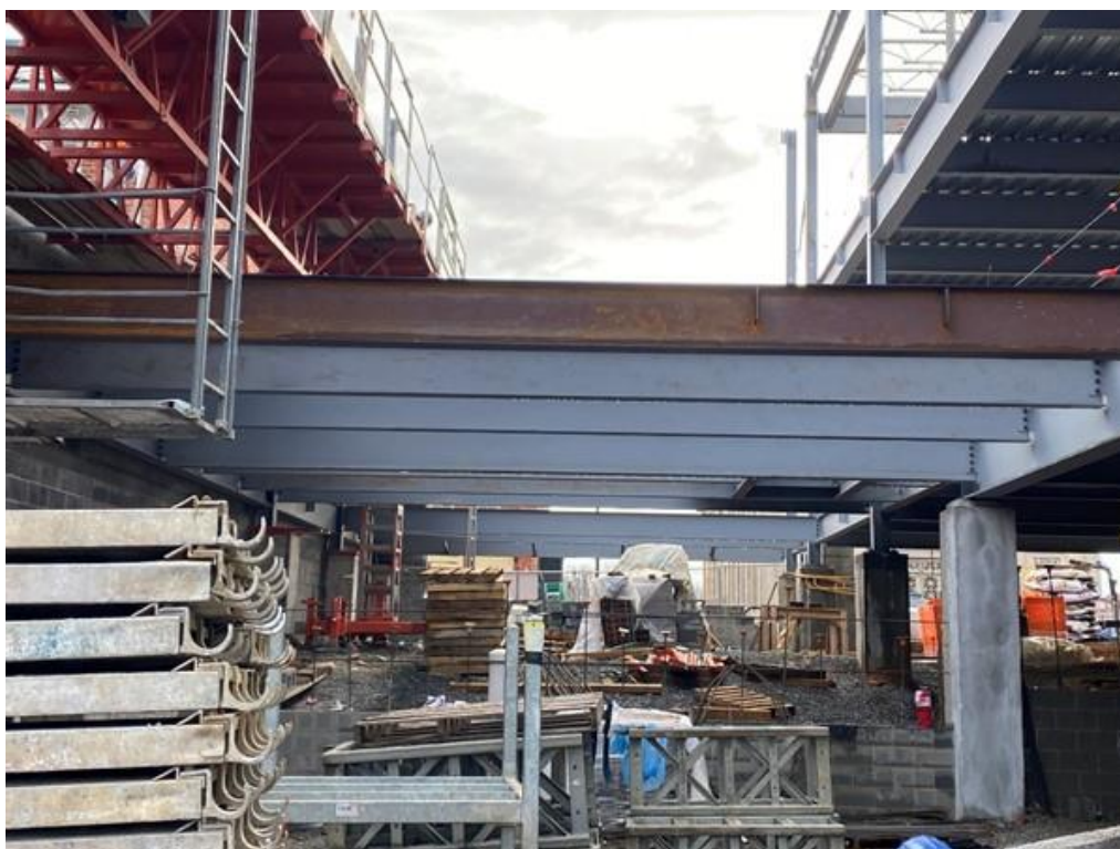
Setting beams third floor