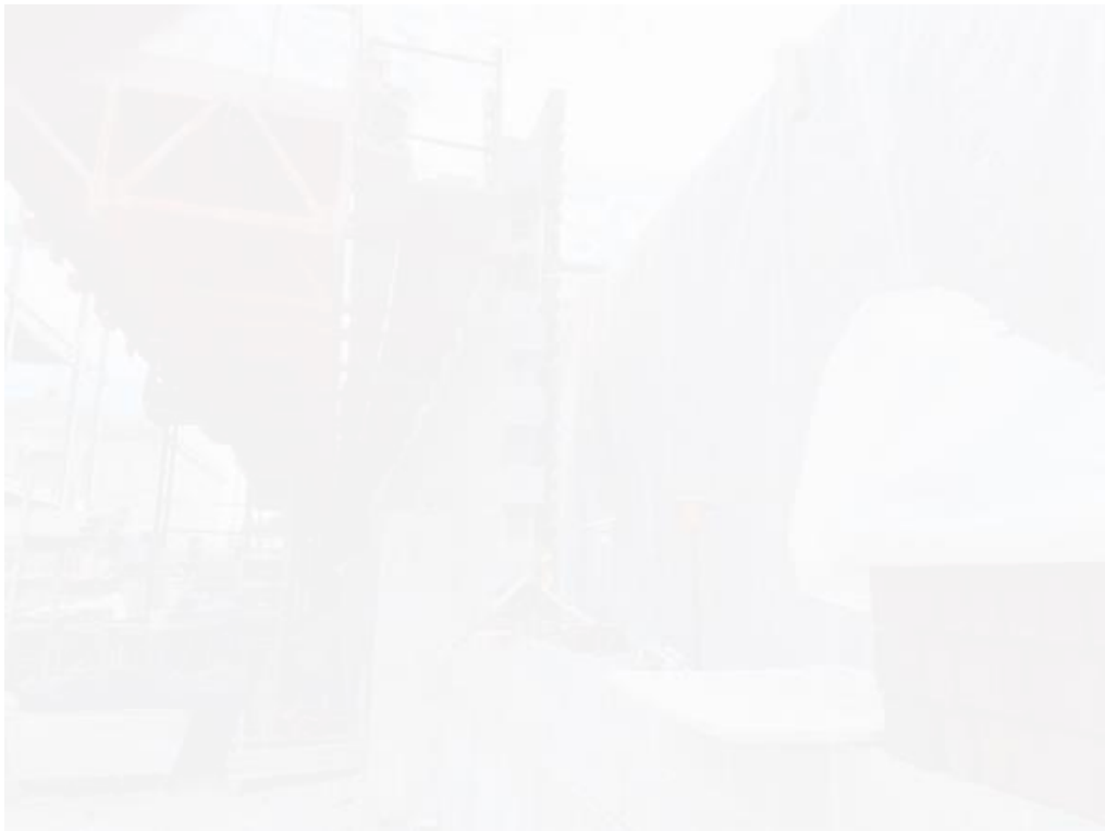
Brick and block installation on XA line, continued