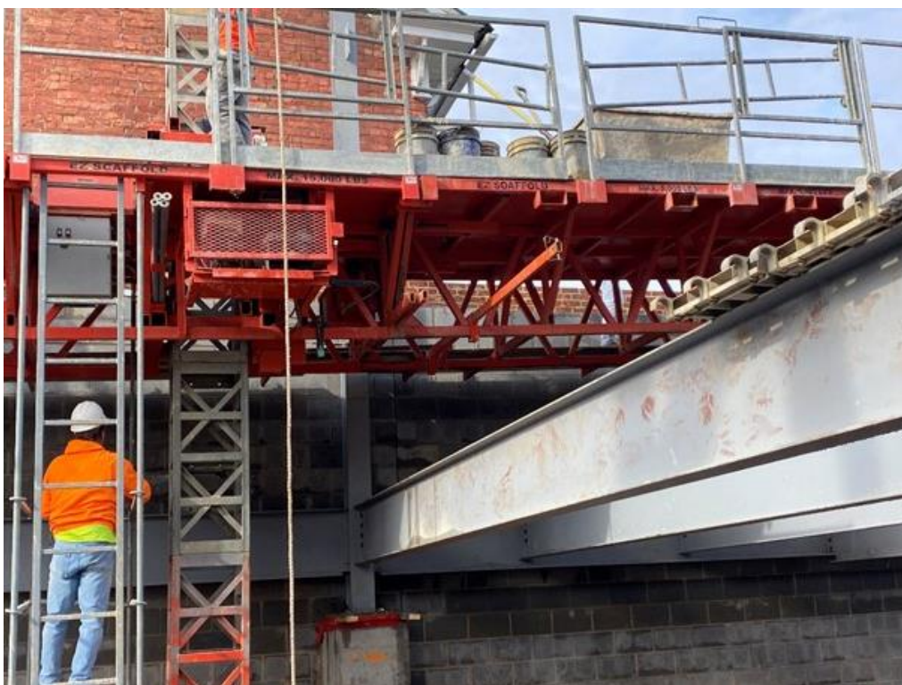
Installing brick and block on XA line, continued