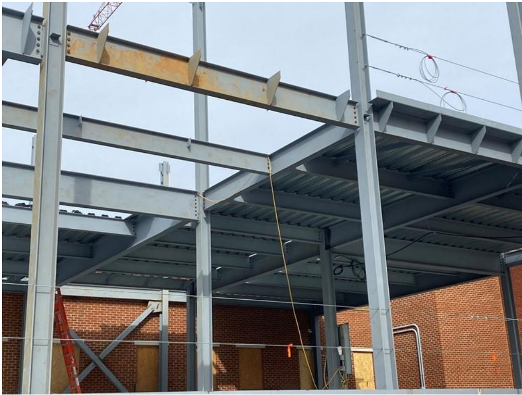
Installing wire guard rail on third floor