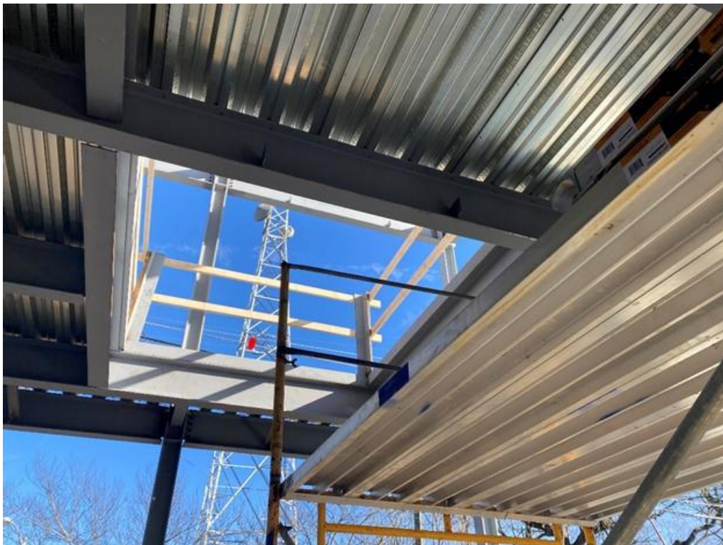
Guard rail installed for third floor elevator opening