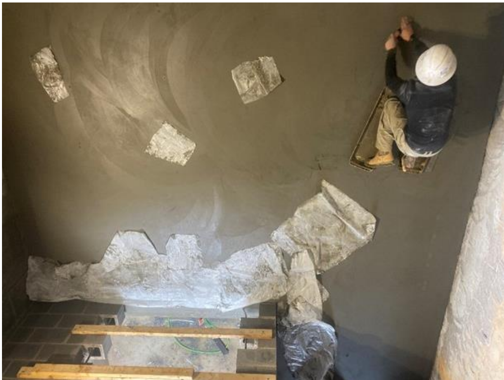
Finishing concrete floor slab at first floor detention area