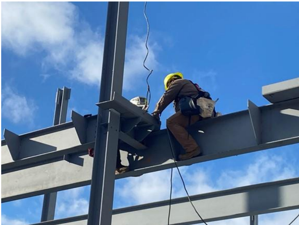
Installing bent plates for sequence 7 steel