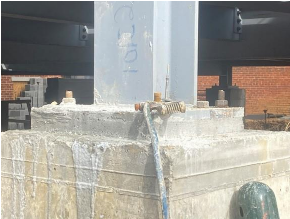
Grouting column base plates