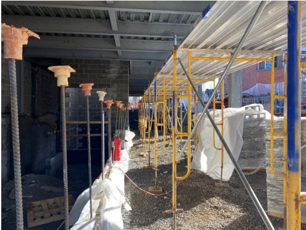
Scaffolding installation at sally port area