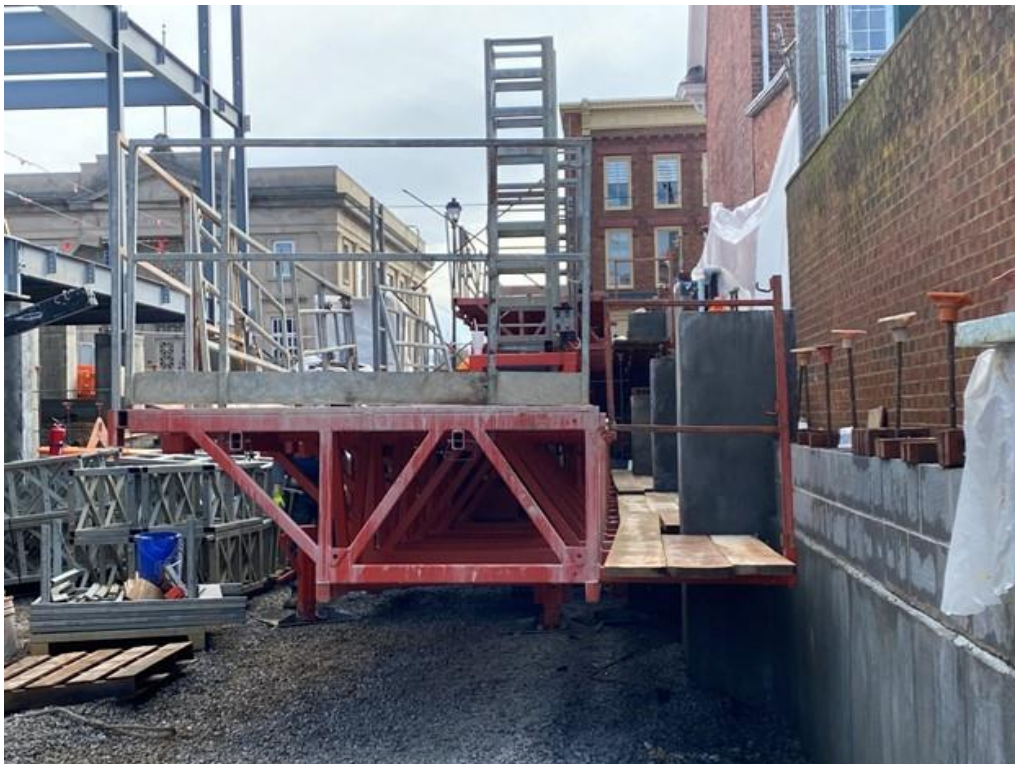
Scaffolding install on XA column line for brick and CMU