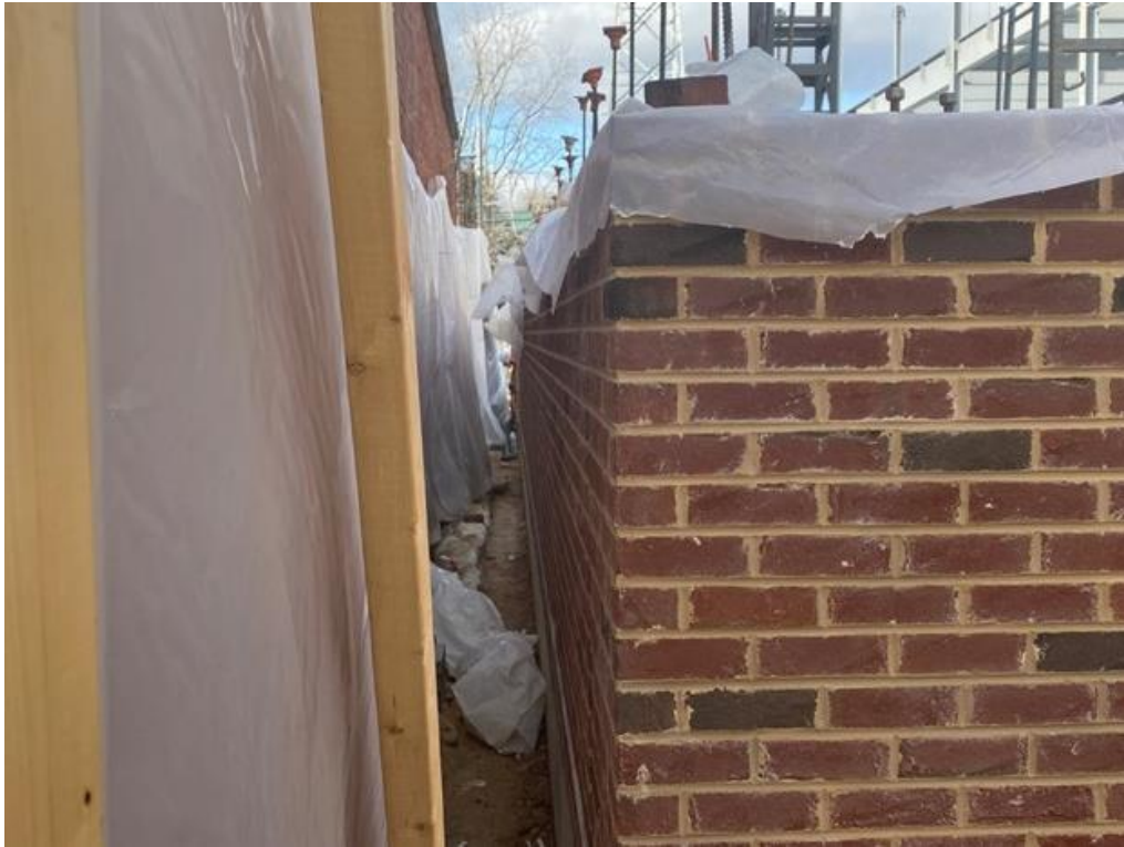
Brick installation on XA line