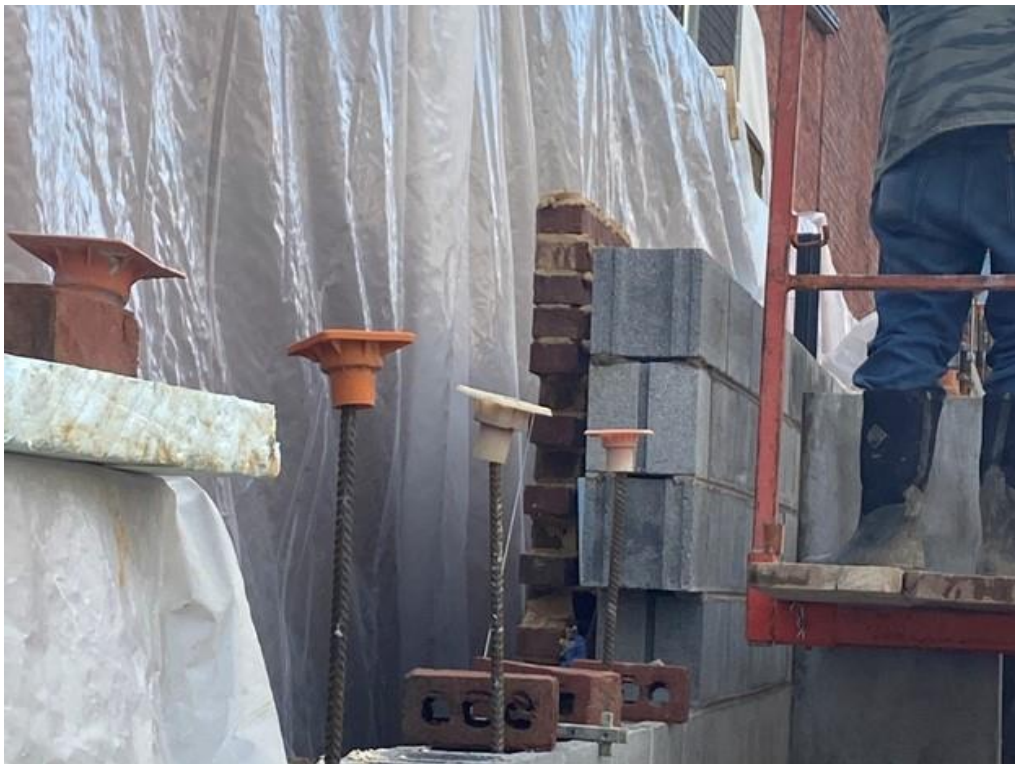
Brick and CMU installation, continued