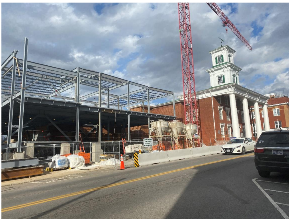
View from Main St., continued