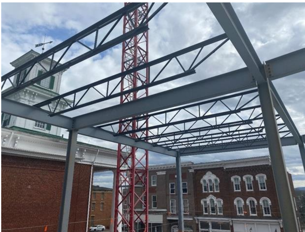
Installing bar joists fourth floor