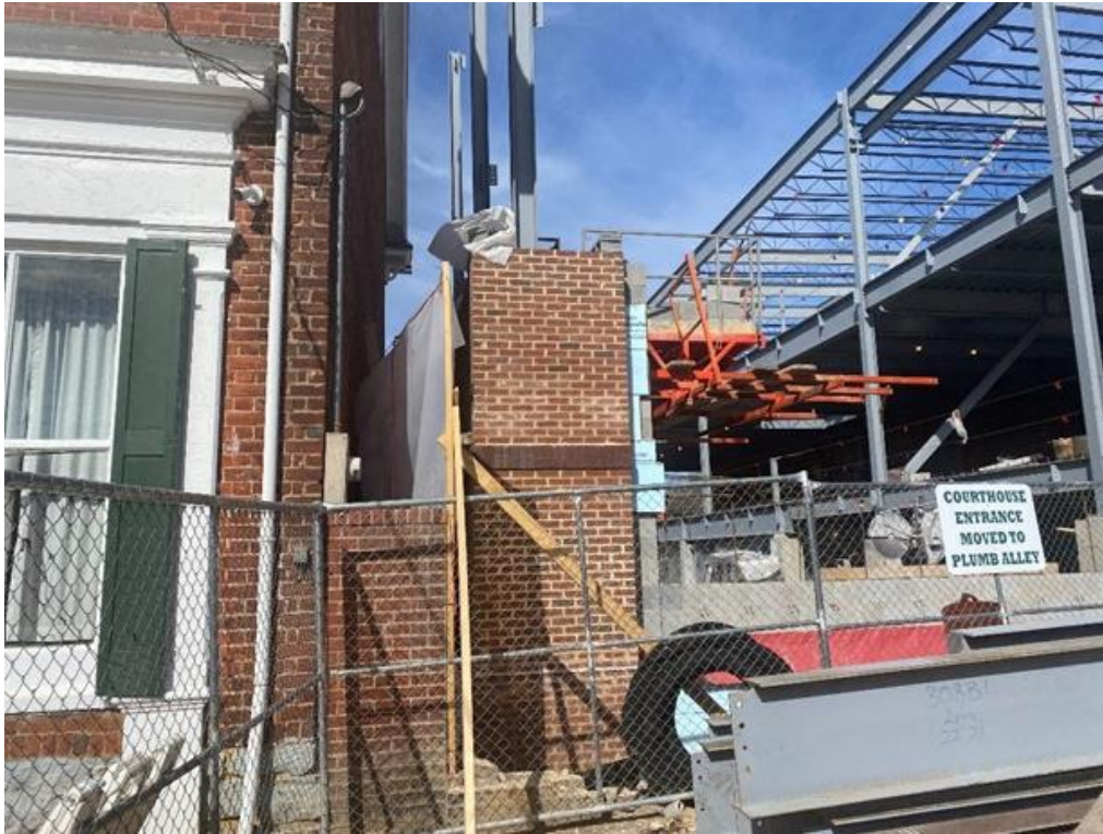
Brick and block installation on XA line