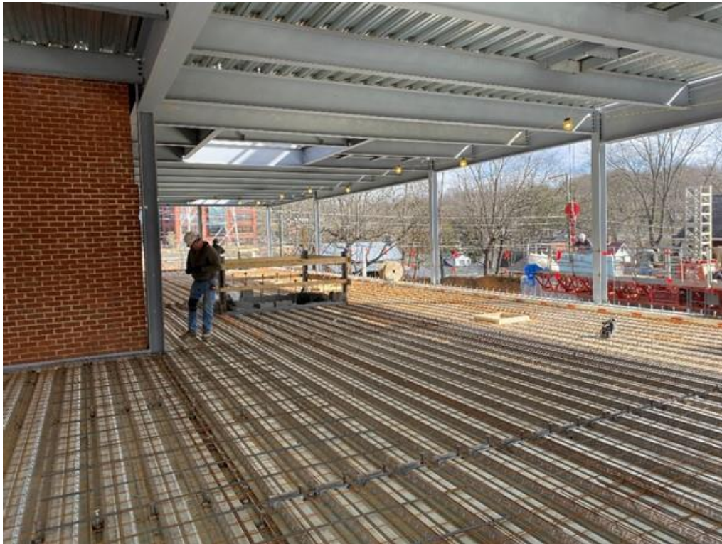
Third floor slab prep, continued