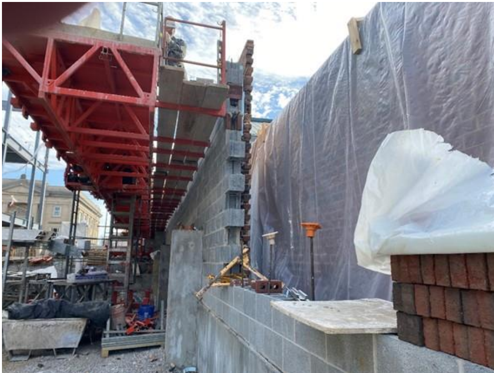
Brick and block installation on XA line, continued