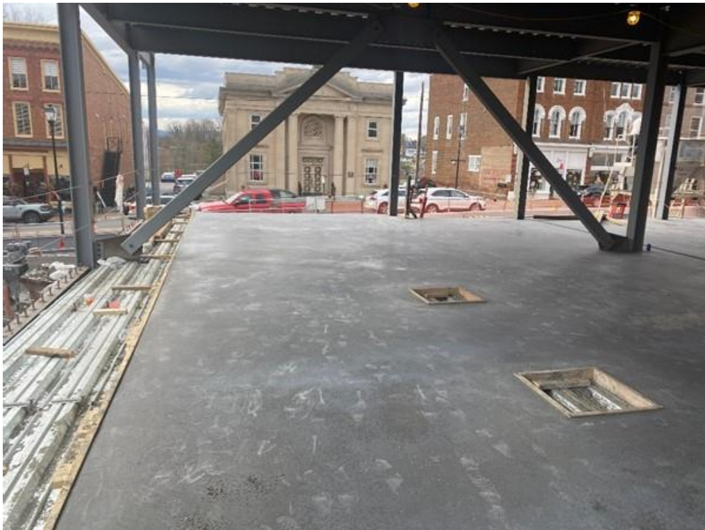
Concrete slab poured on third floor