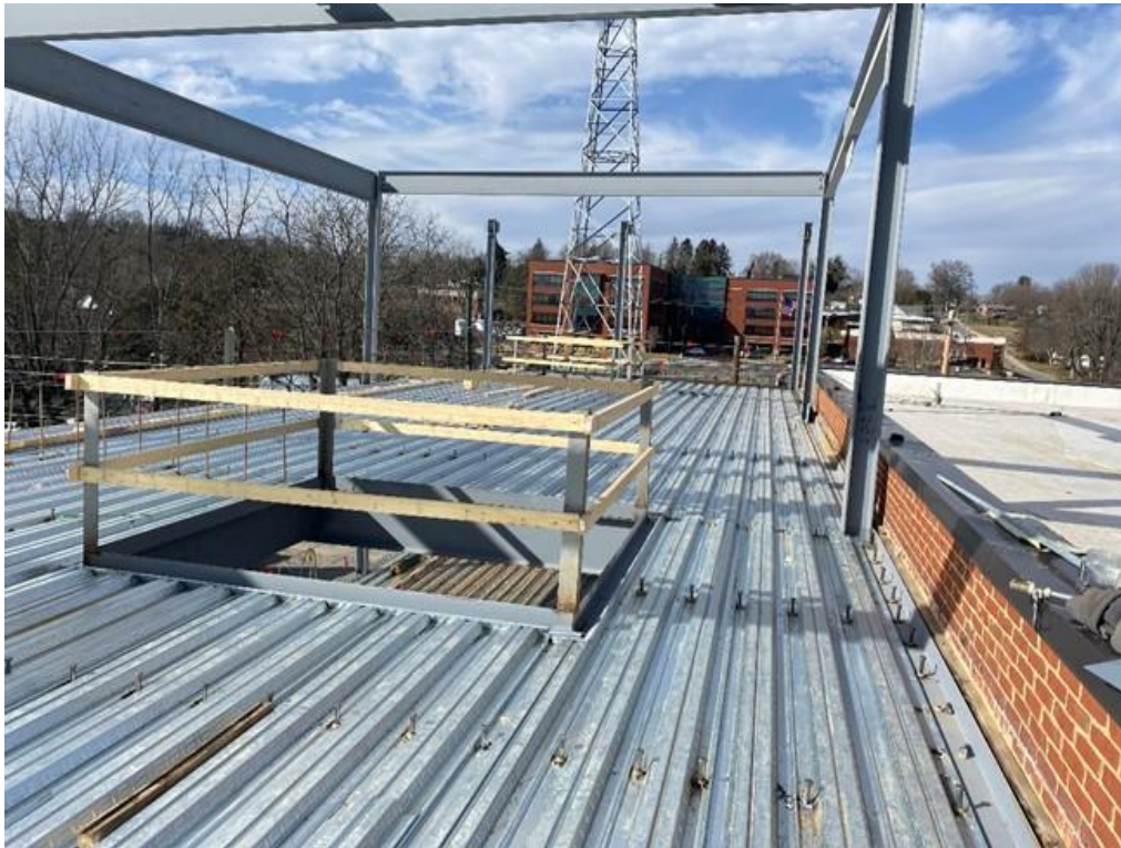
Fourth floor decking, trim out and temporary barricades