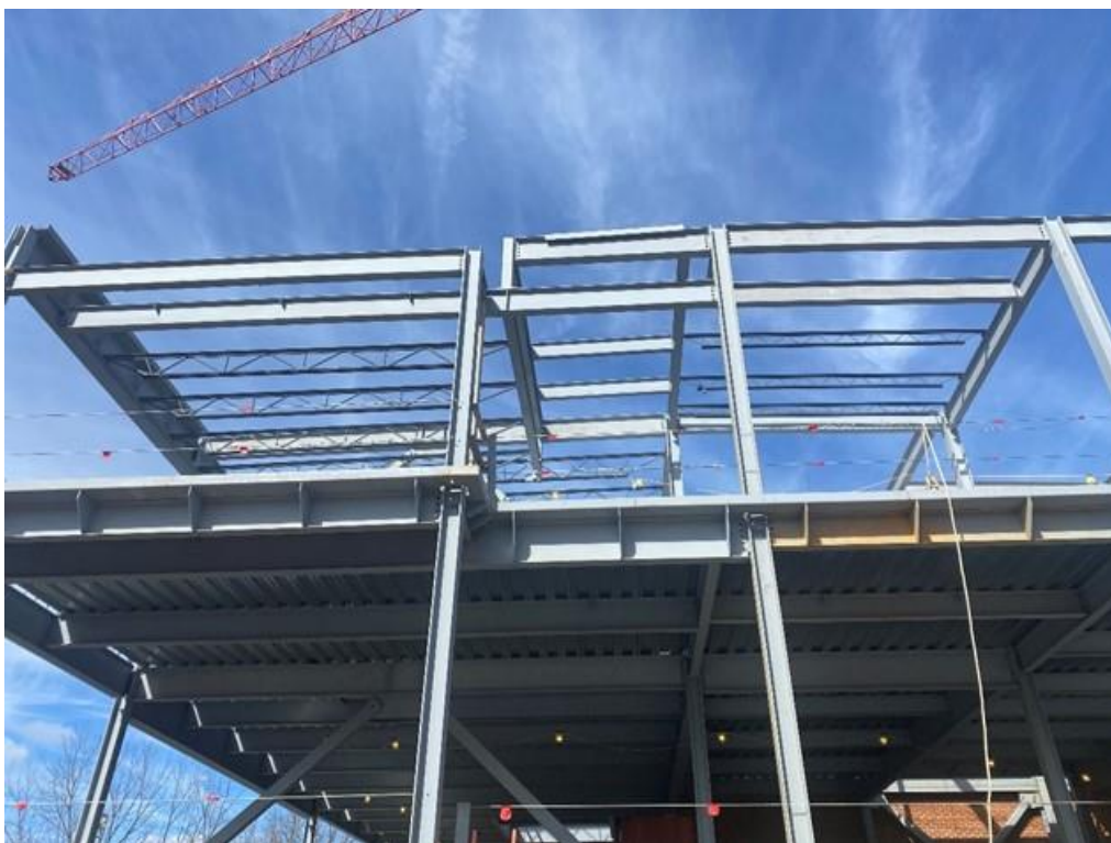
Installing bar joists fourth floor, continued