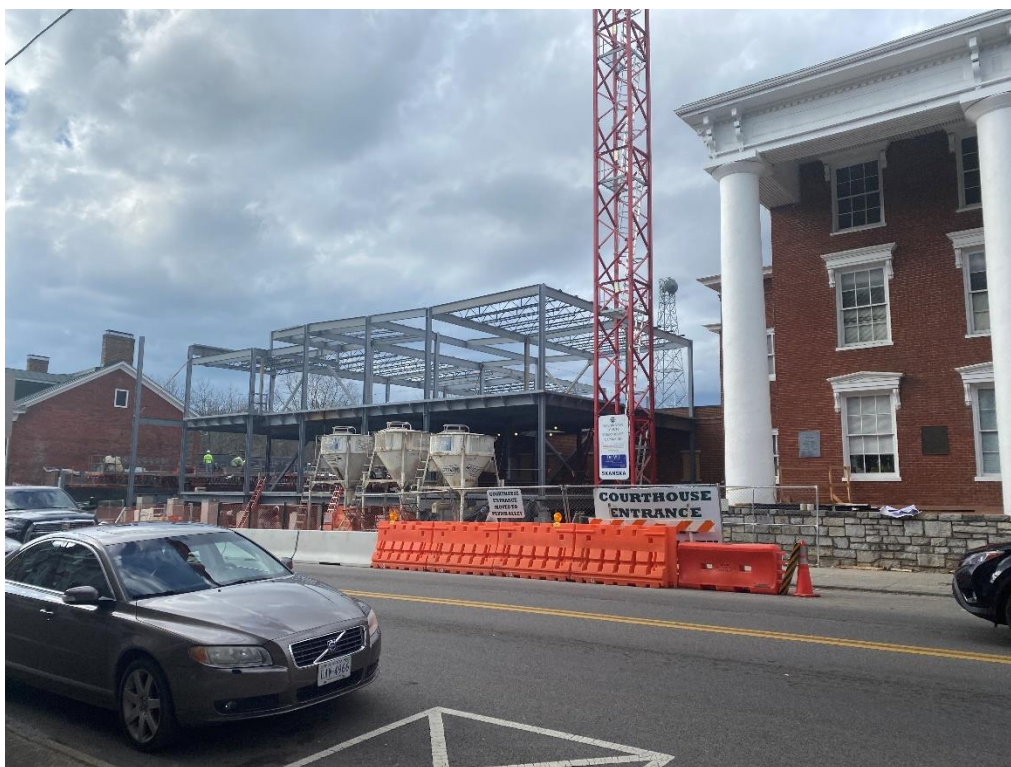
View from Main St.