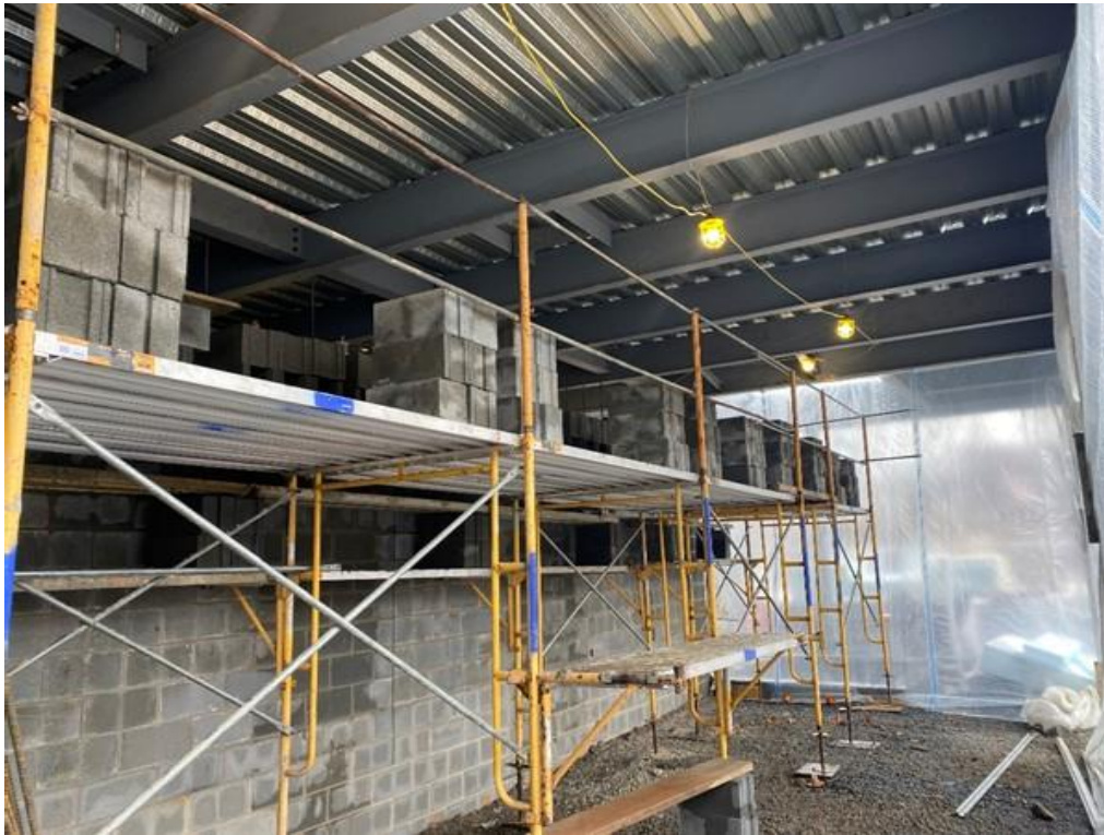
CMU wall installation at elevator 1 electrical room