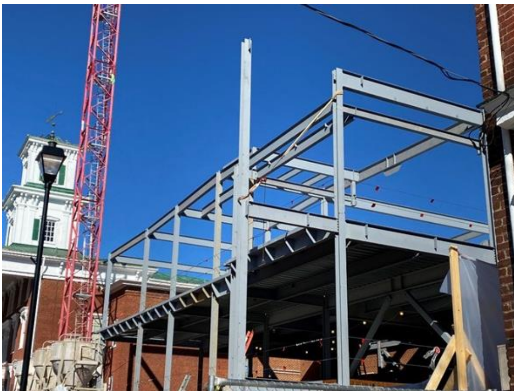
Steel roof framing installation, continued