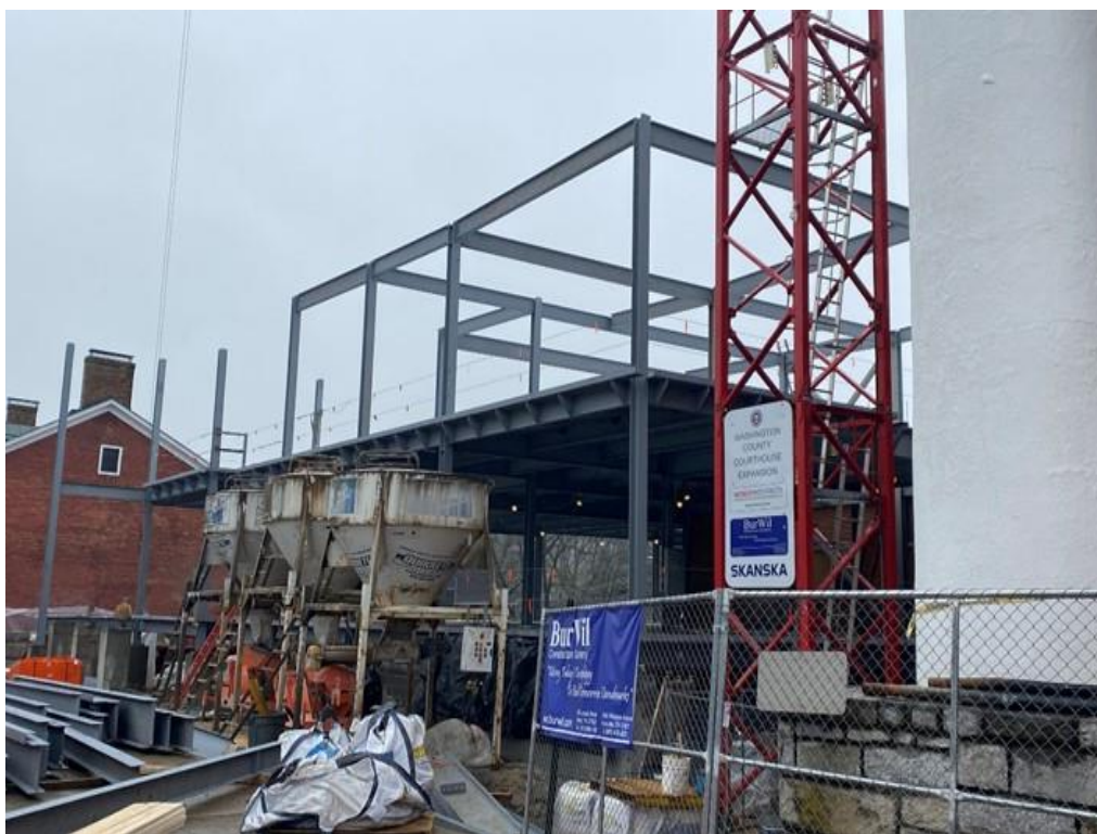
Steel erection for sequence 12