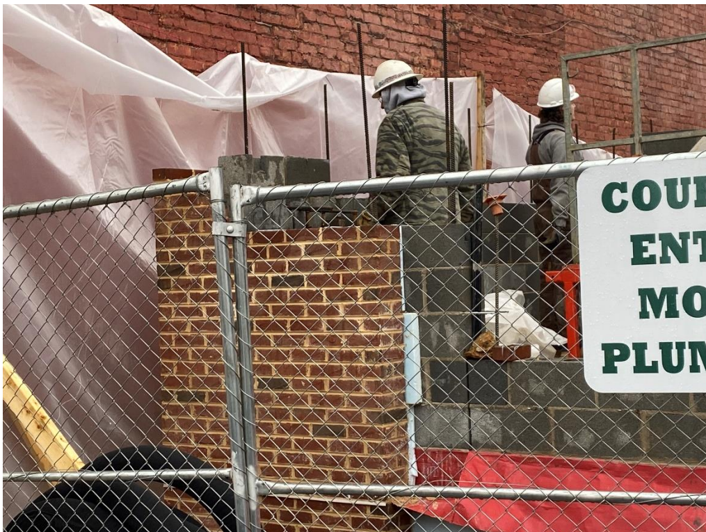
Brick and block installation on XA line, continued