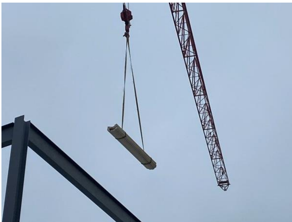
Steel erection for sequence 12, continued