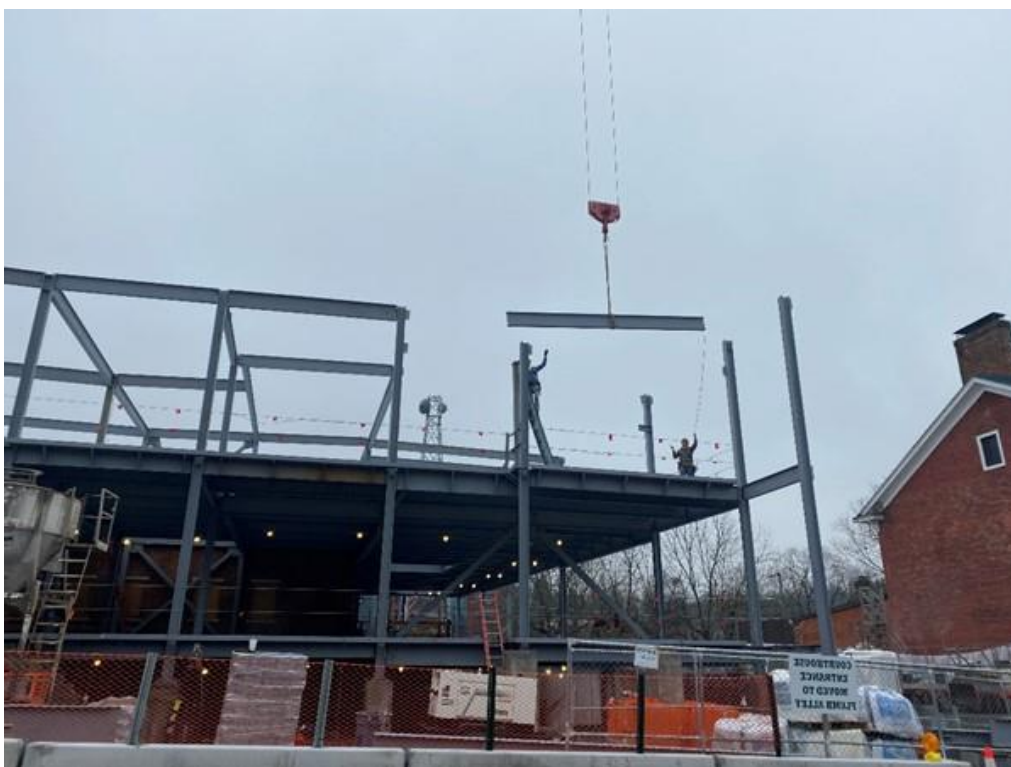
Setting steel for roof framing