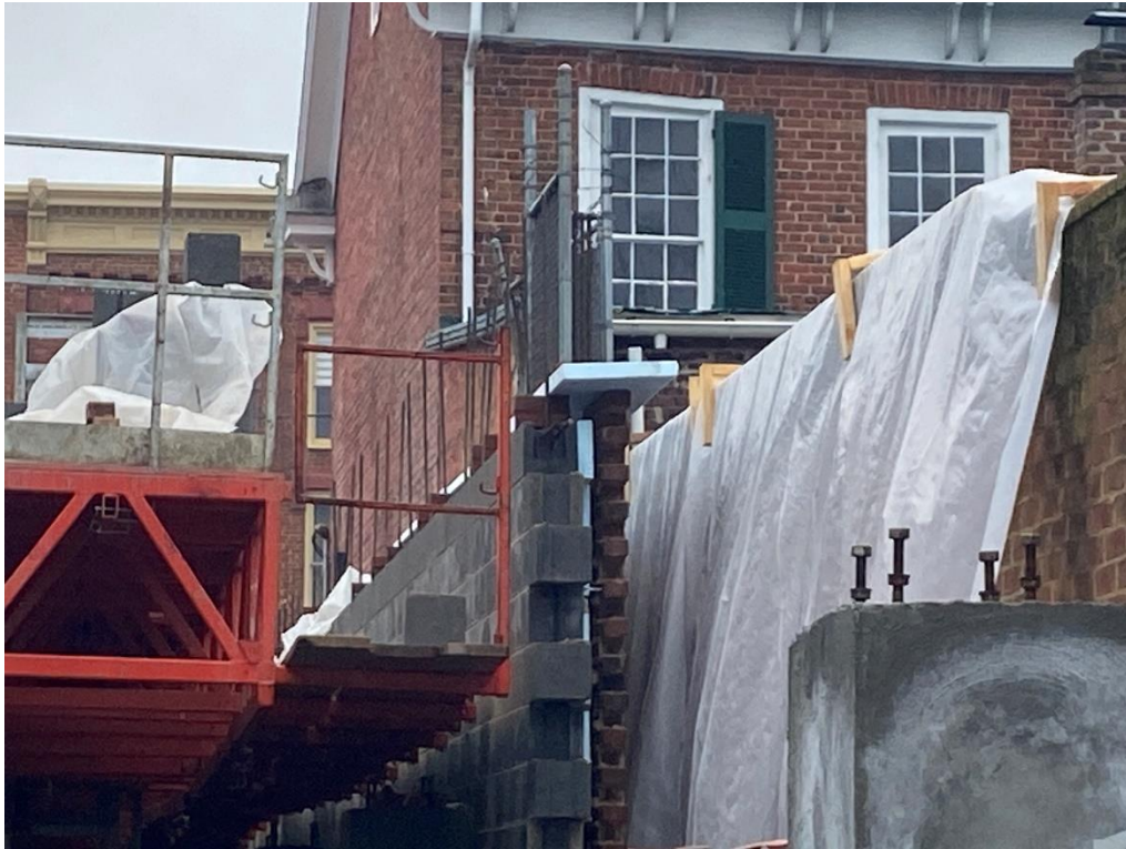
Brick and block installation on XA line