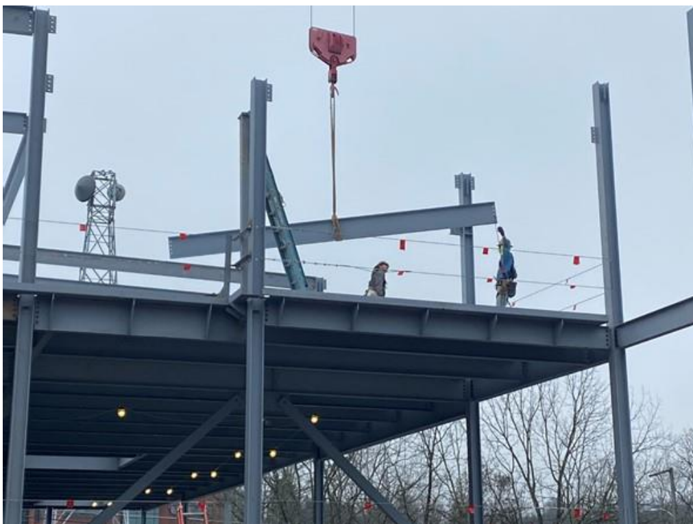
Setting steel for roof framing, continued