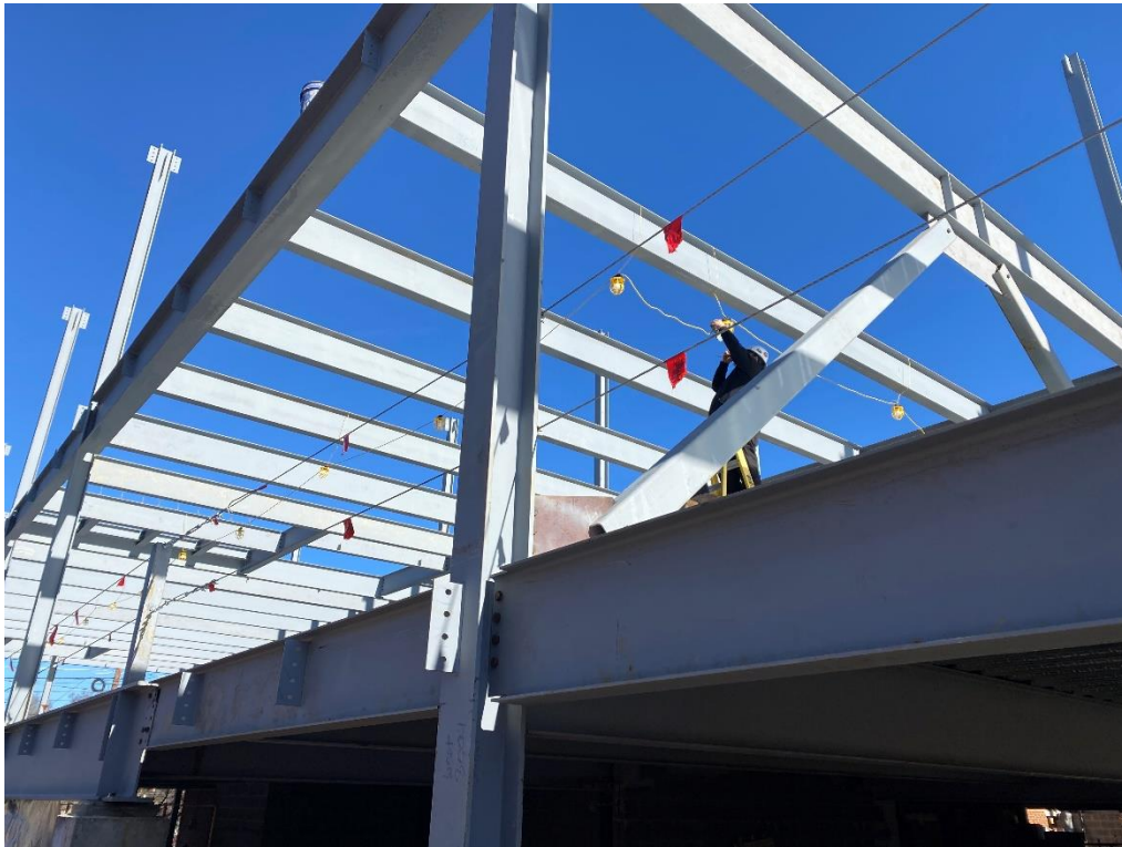
Installing decking fasteners and temporary lighting