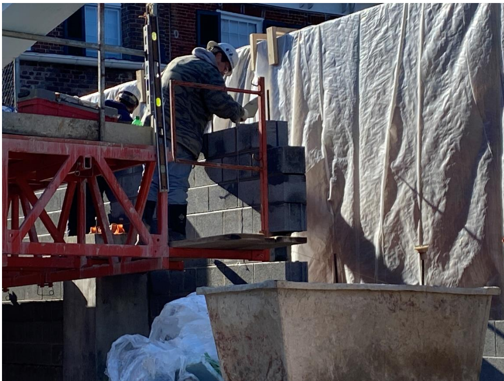
Grouting CMU walls