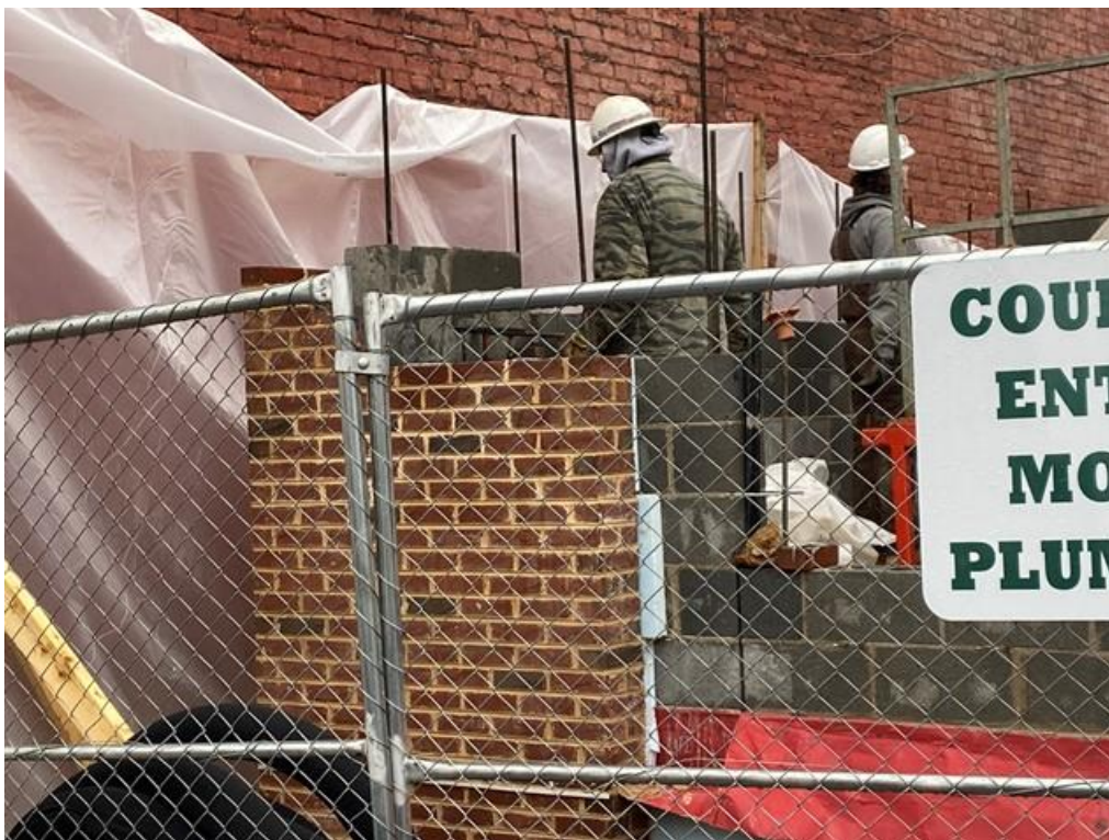
Installing block and brick along XA line, continued