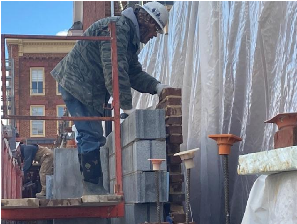
Installing block and brick along XA line