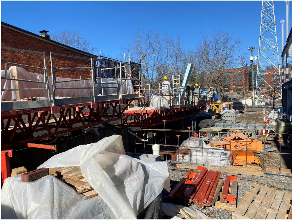
Scaffolding installed for masonry work along XA line wall