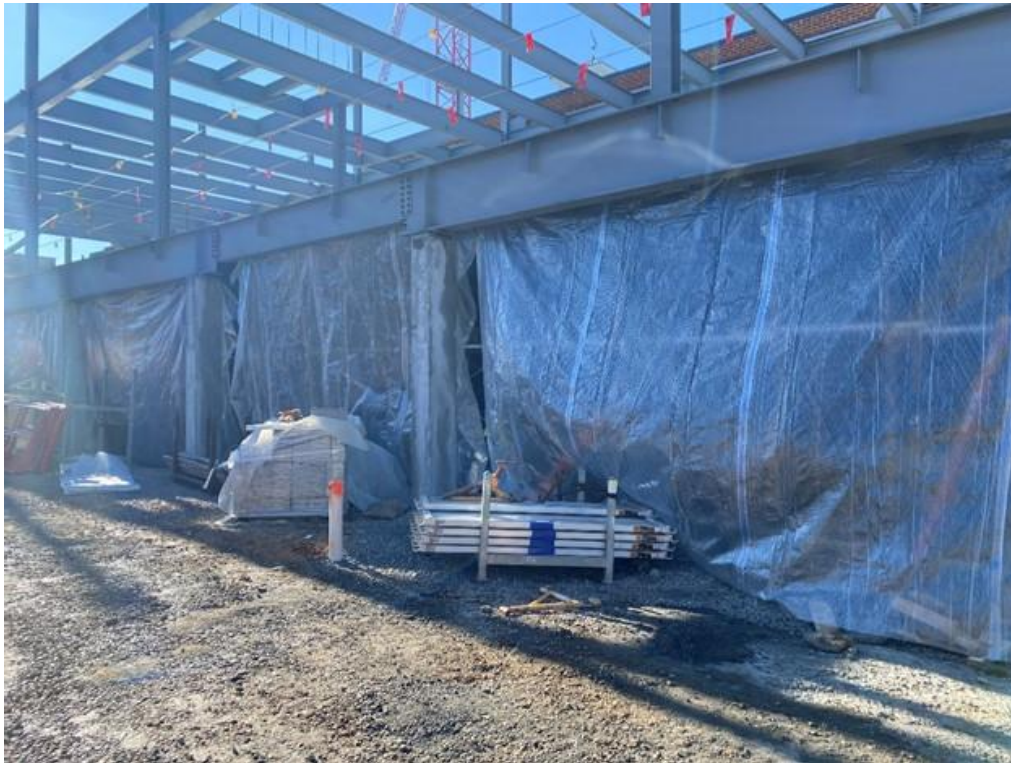
Tented area for cold and wet weather masonry work