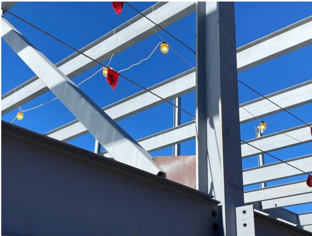
Installing decking fasteners and temporary lighting, continued