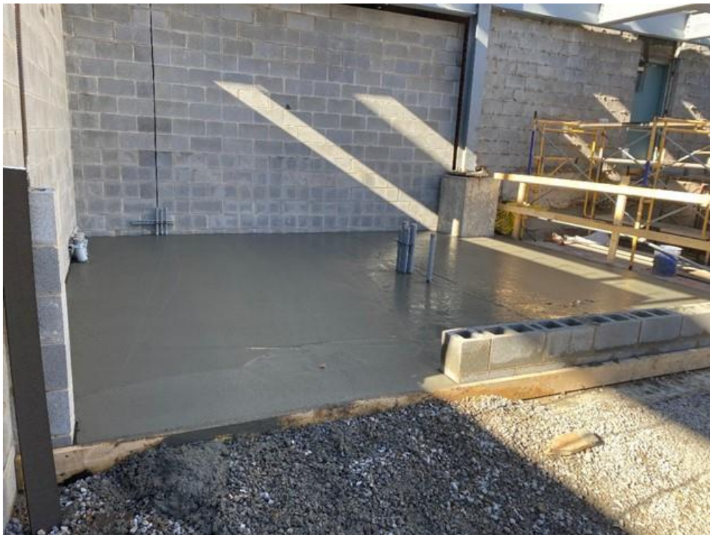
Concrete slab poured in electrical room