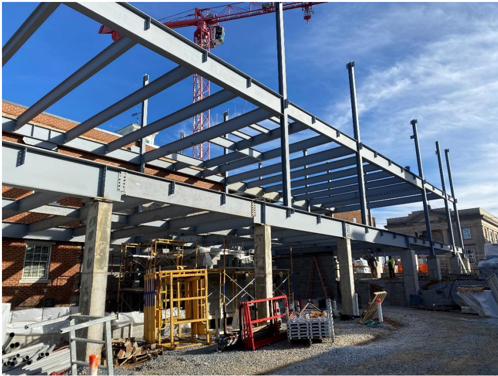
Steel erection from Plumb Alley side