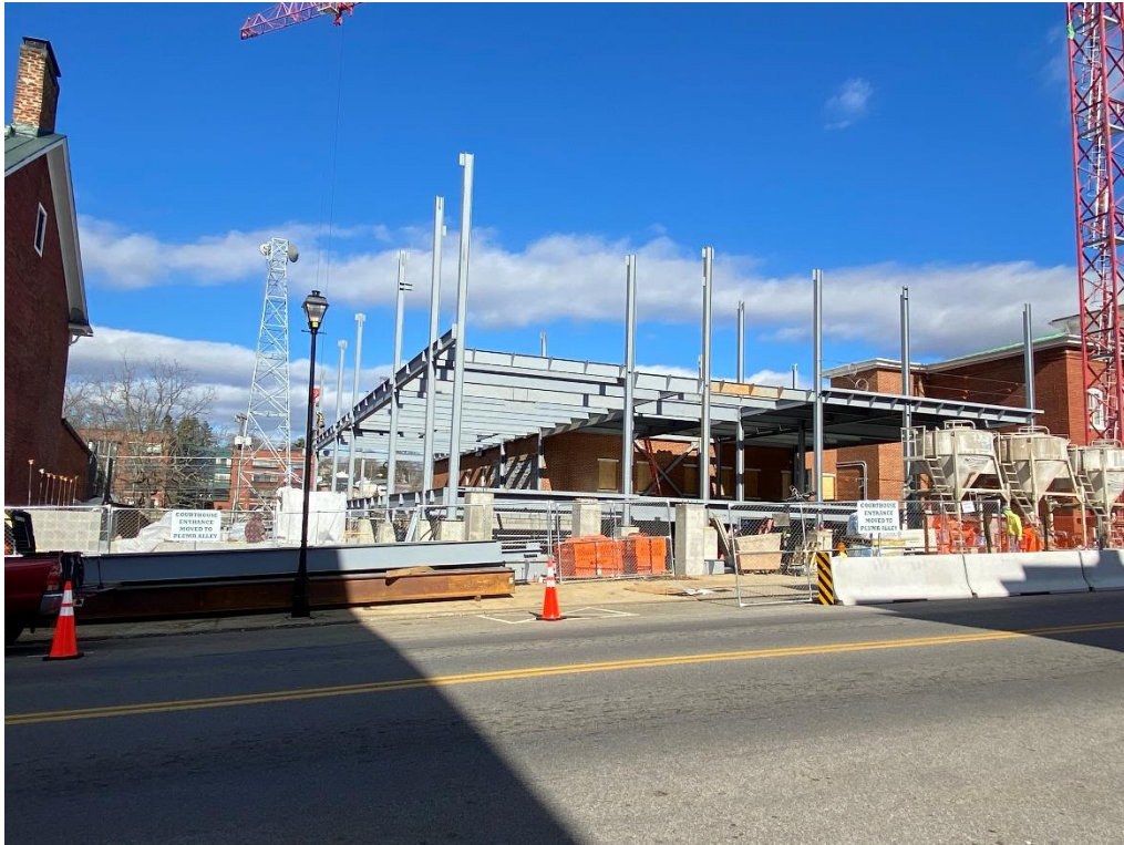
Steel erection from Main Street