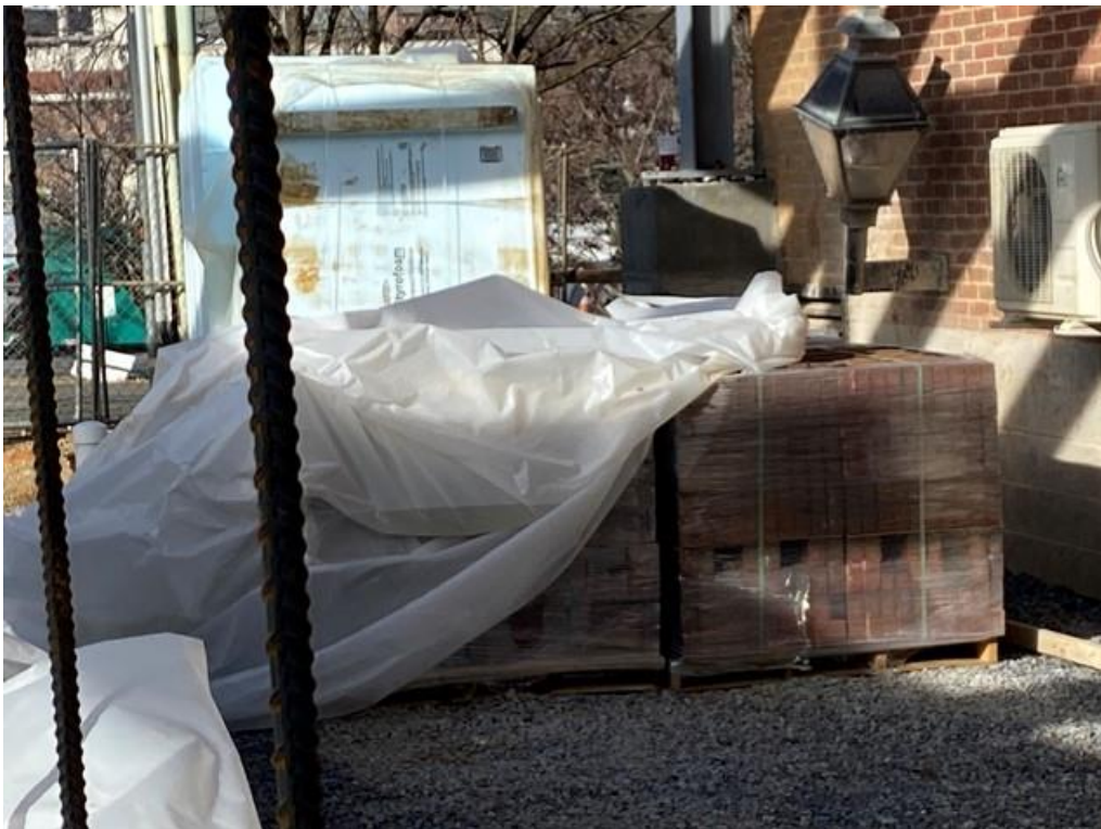
Brick delivered to site