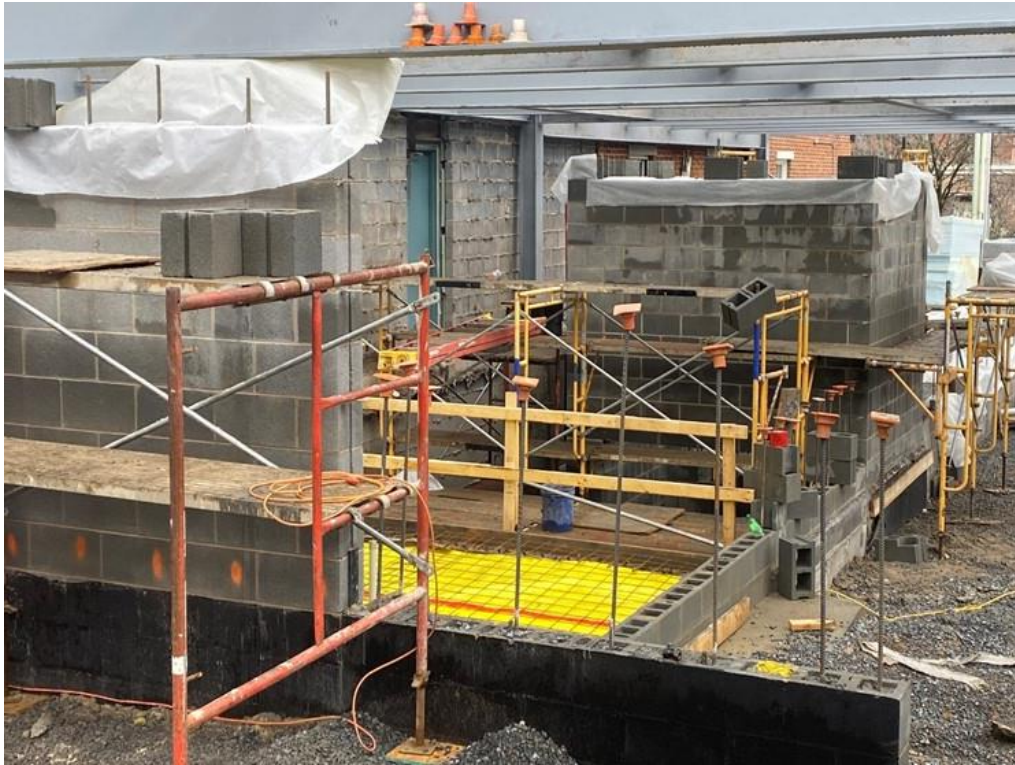
Pest treatment for elevator slab and equipment rooms