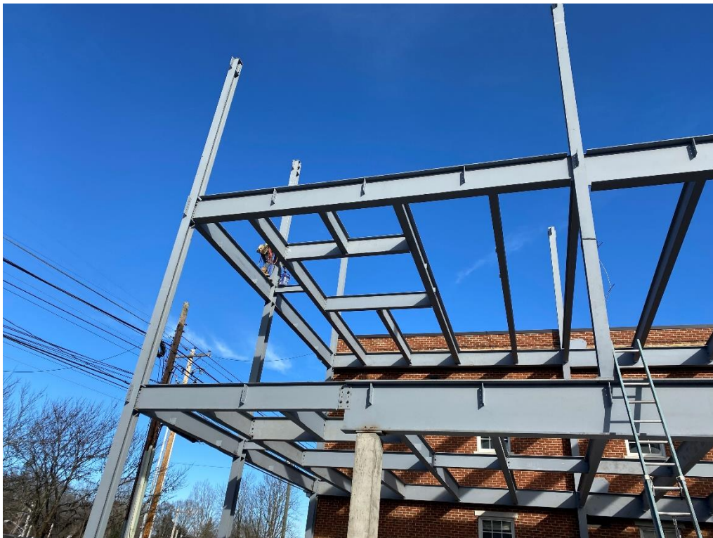
Steel erection from Plumb Alley side, continued