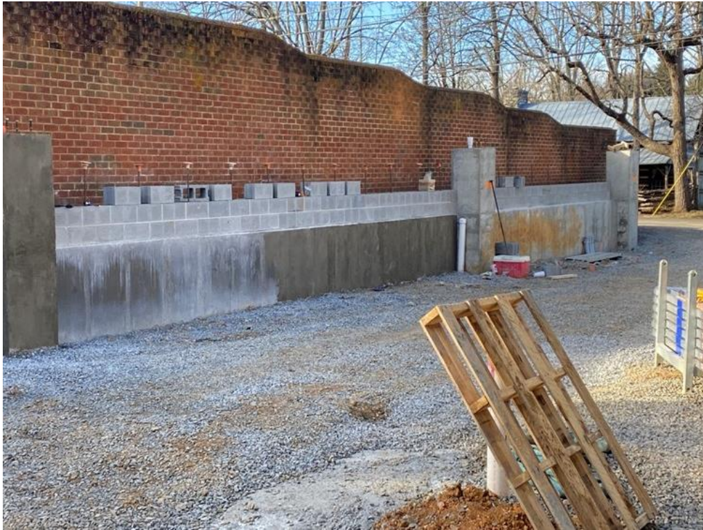
Patching and rubbing concrete wall and piers