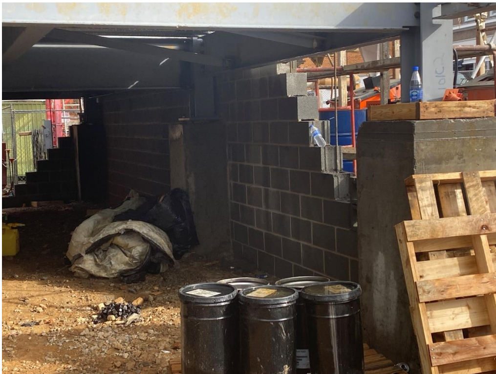
CMU wall installation, continued