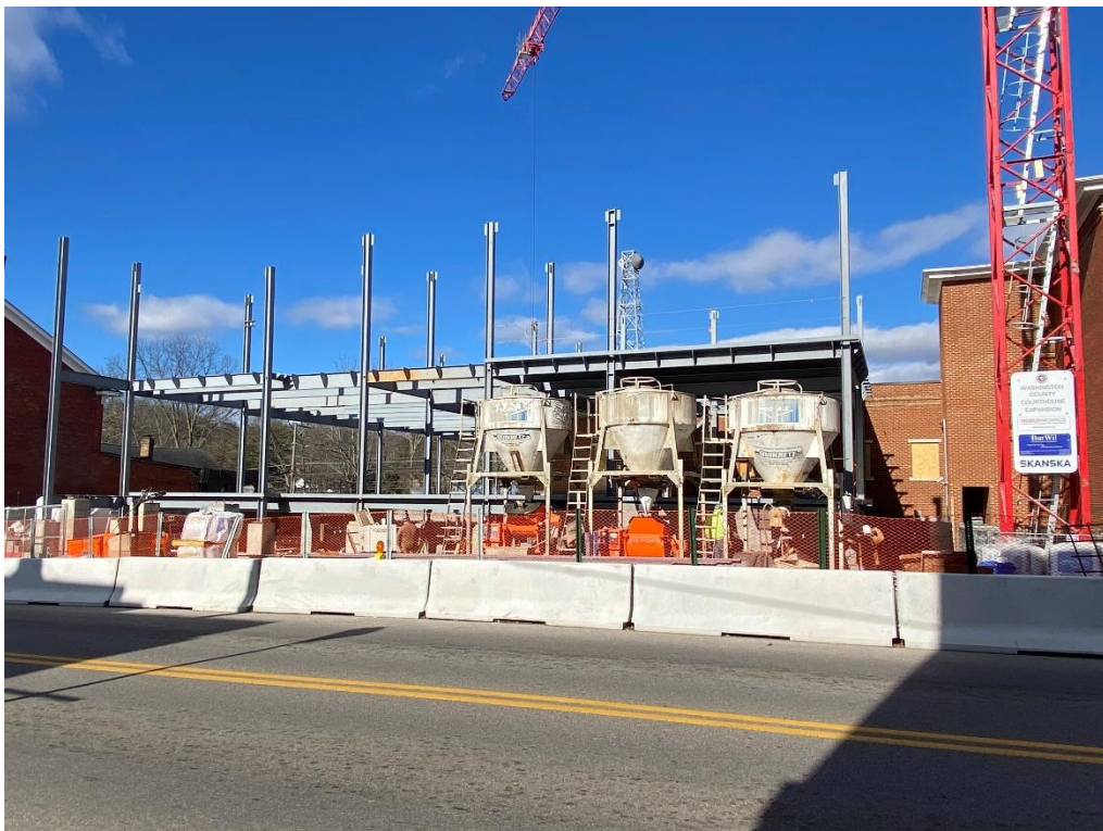
Steel erection from Main St, continued