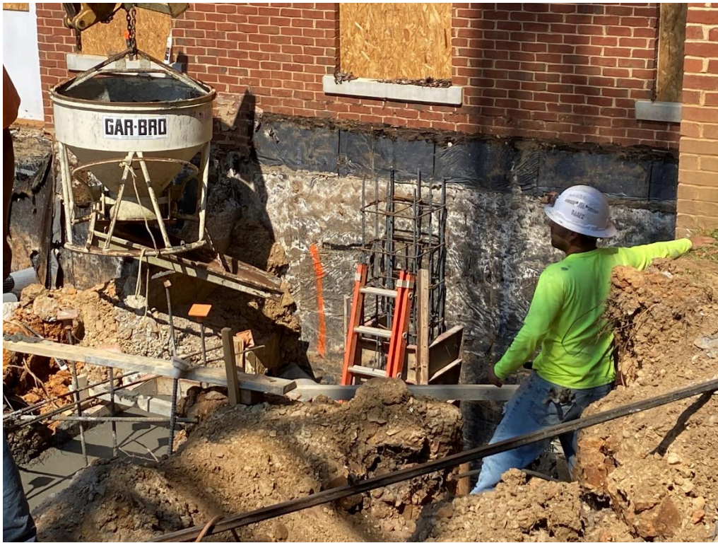
Pouring concrete for column