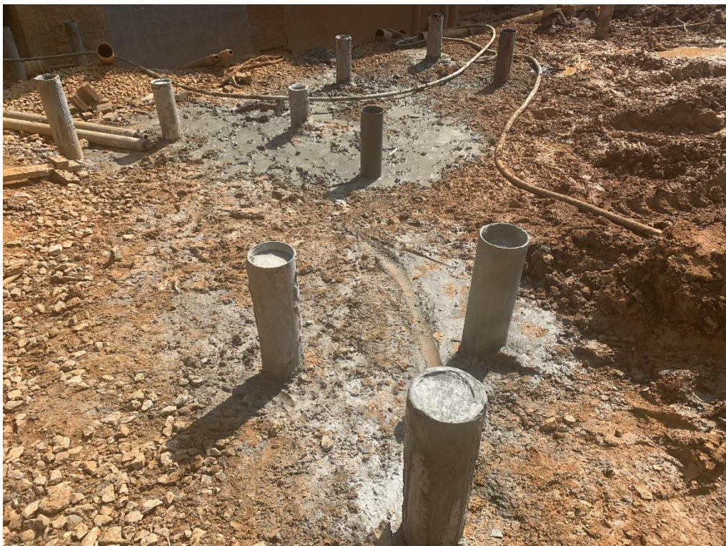
Micro piles installed