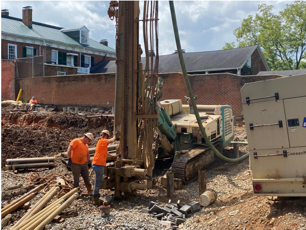
Drilling micro piles