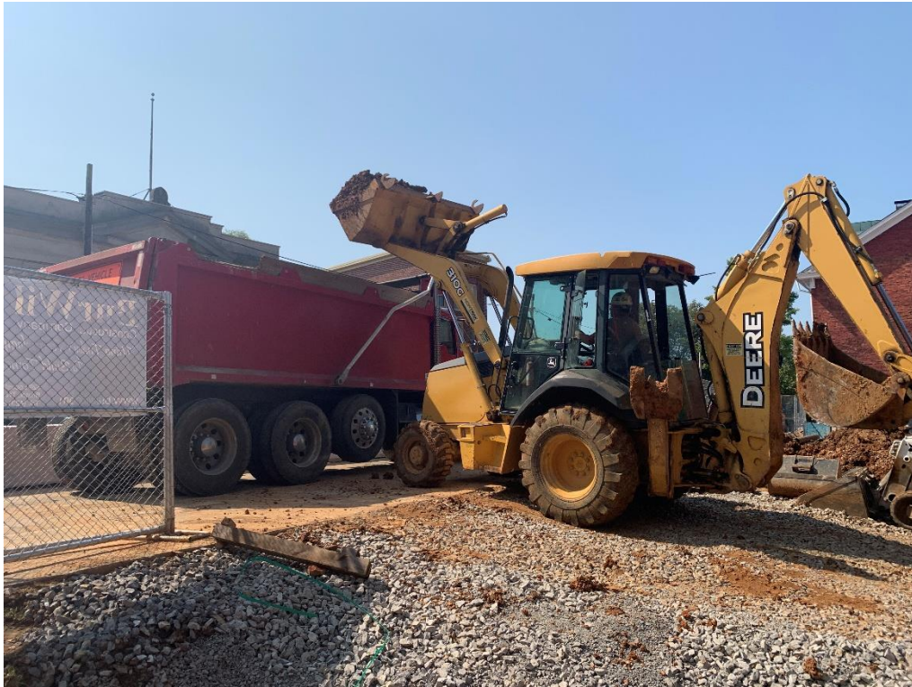
Loading and hauling of spoils from foundation excavation