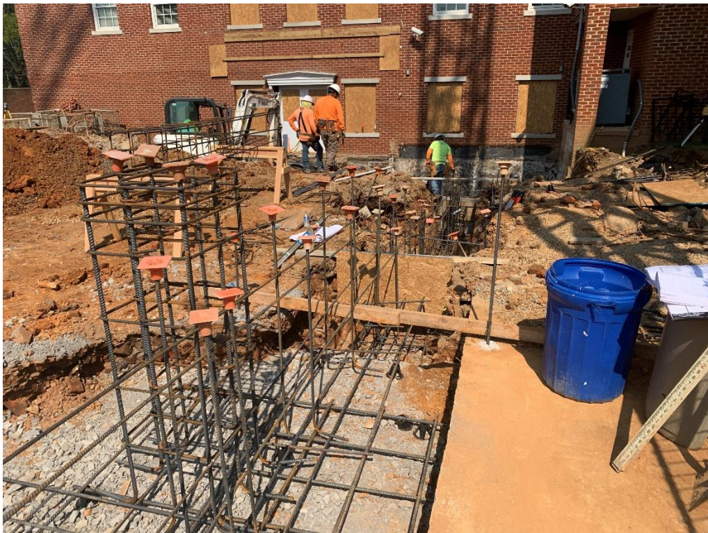
Install of rebar and form work for footings column line XK