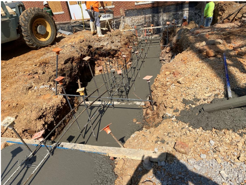
Concrete poured for footings column line XK