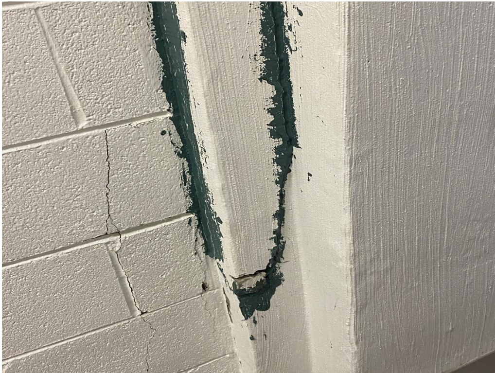
Column crack repair in sally port