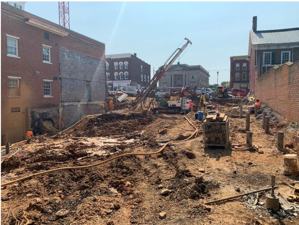
Site facing south toward Main St