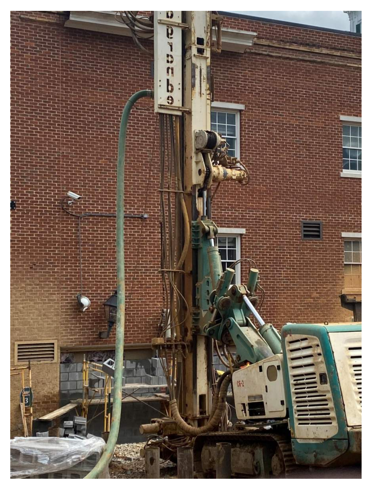
Micro pile installation