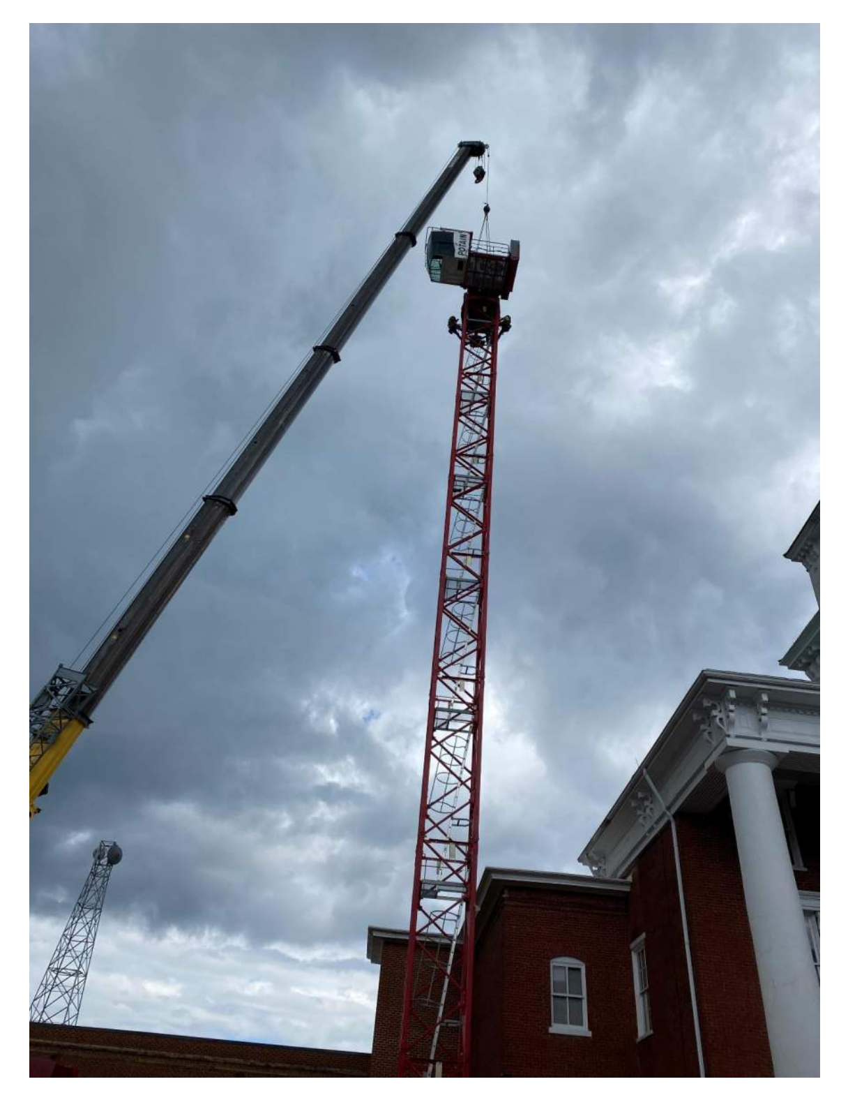
Tower crane installed