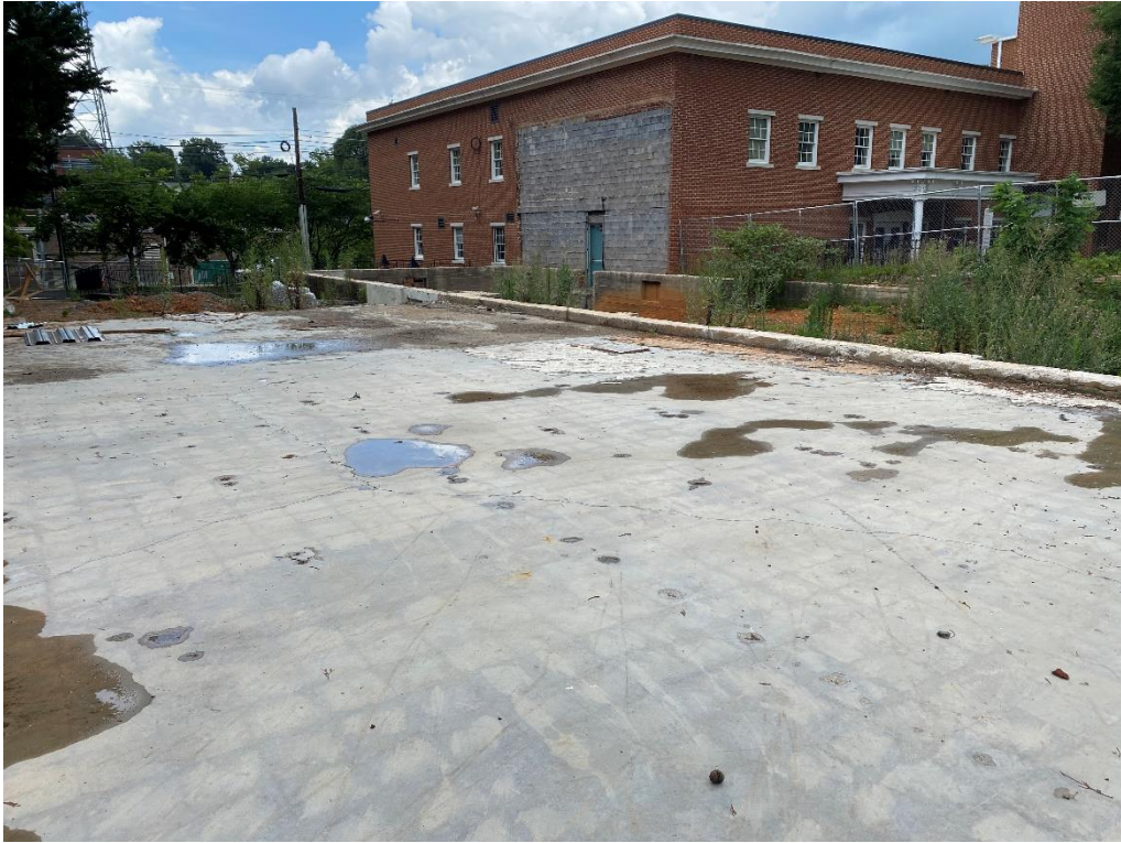
West end of site prior to demolition