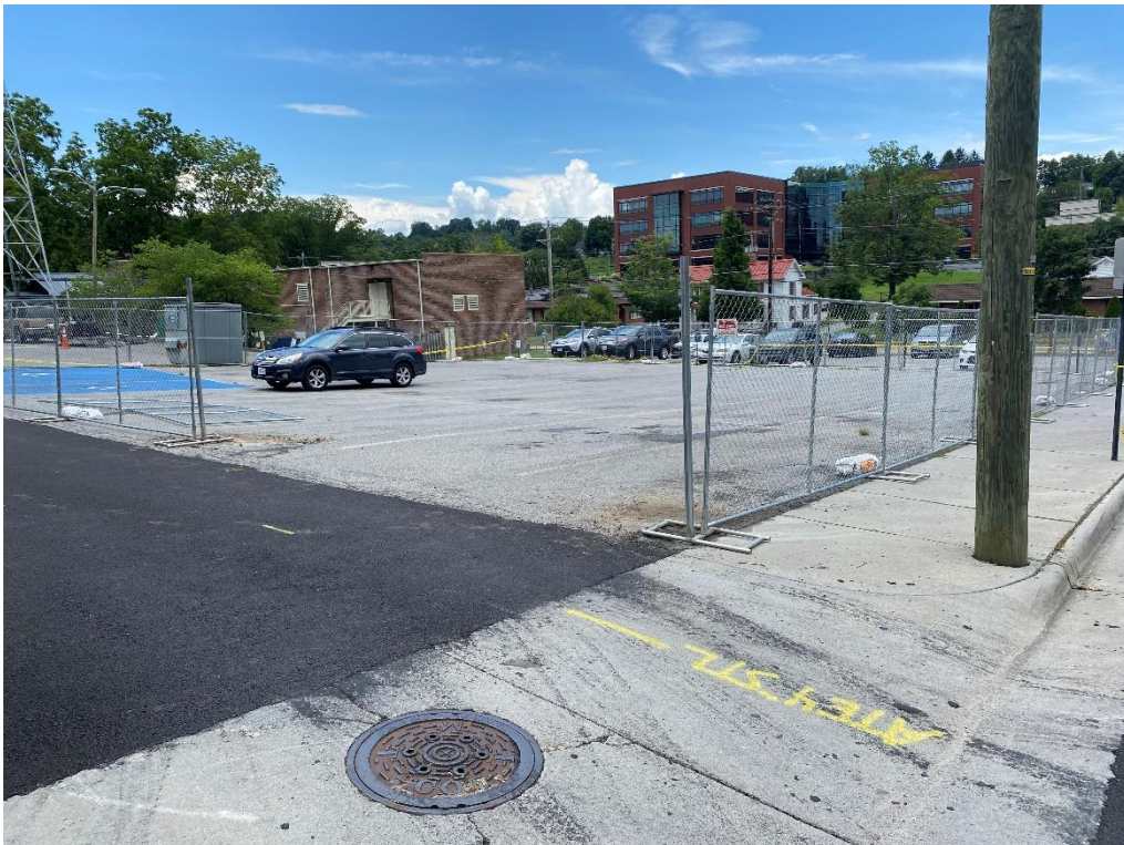
Temporary fence installed behind Courthouse