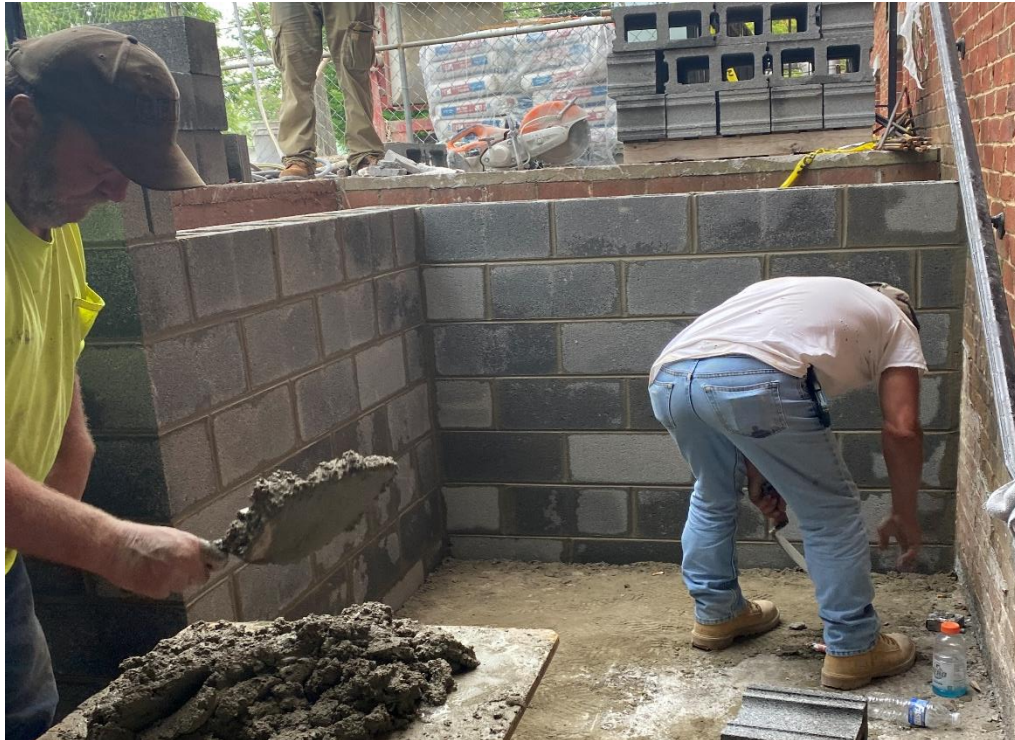
Installation of walls for ADA lift