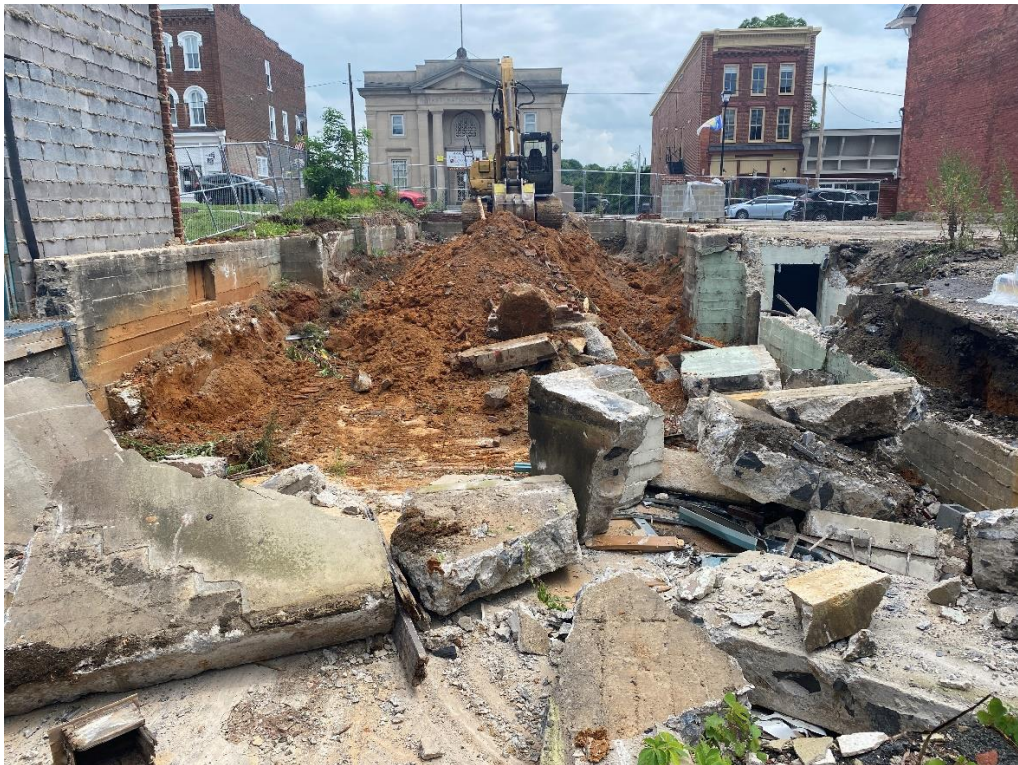
Demolition of sally port/foundation walls